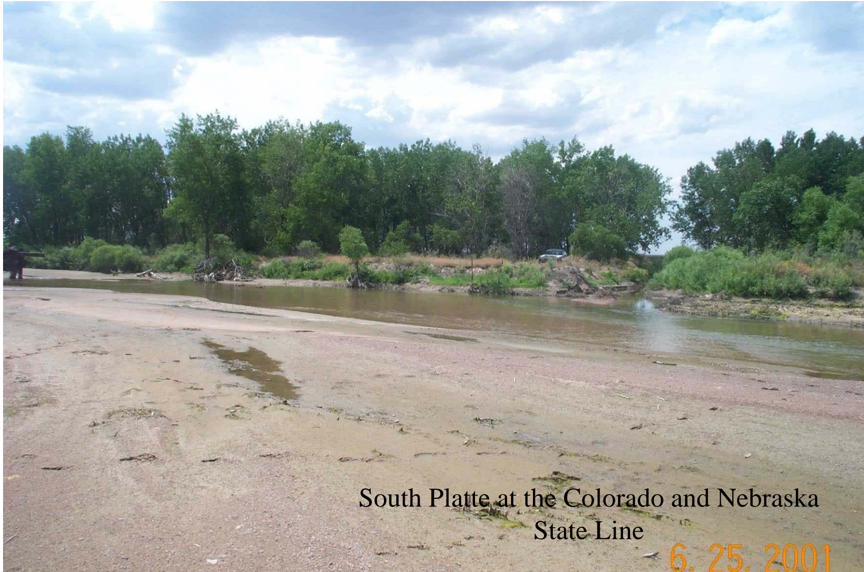
South Platte at the Colorado and Nebraska State Line