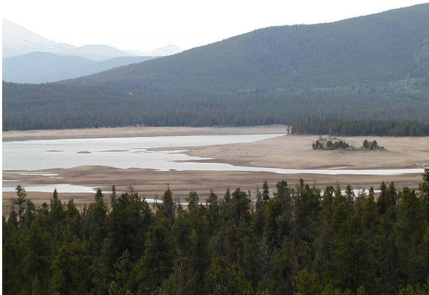
Dillon – Fall 2002