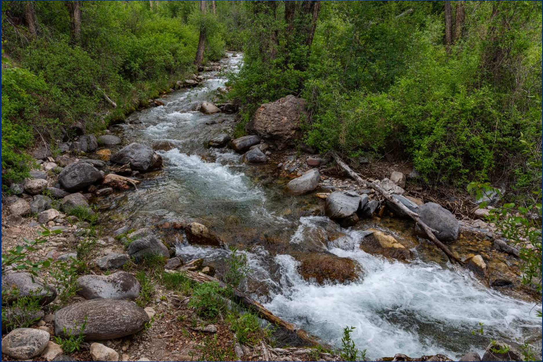
Lower Deep Creek