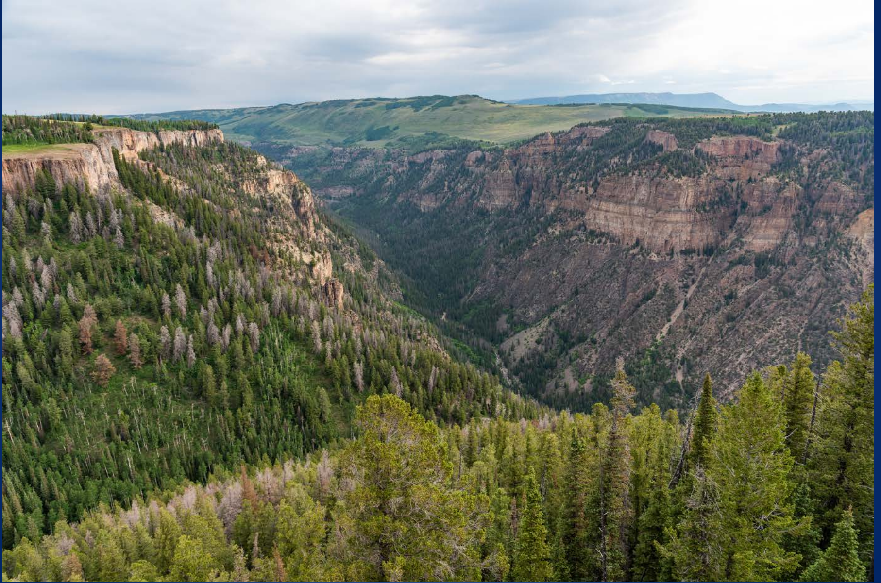
Looking NW from the Overlook