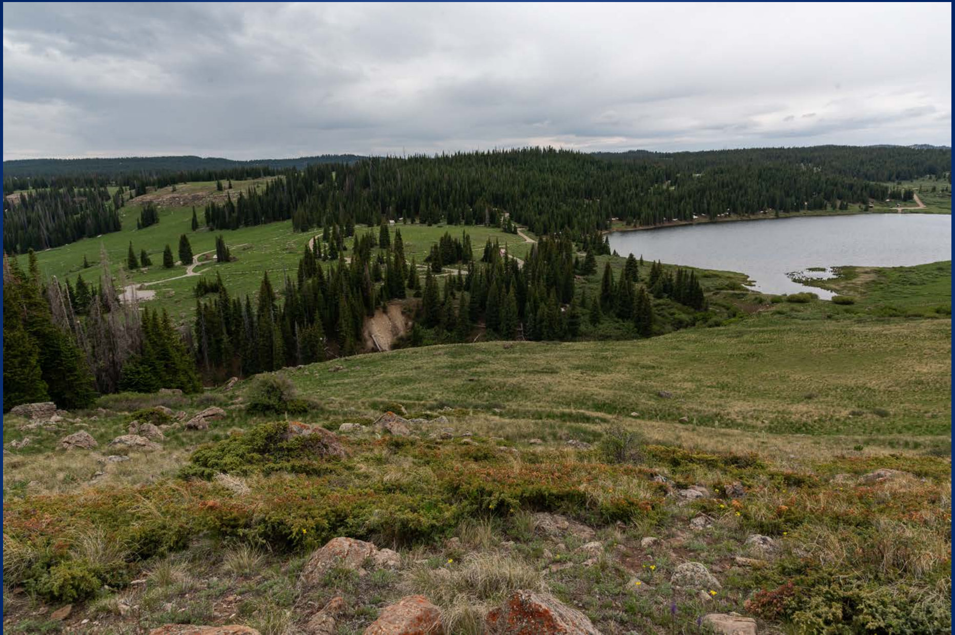
Top of the canyon at Deep Lake