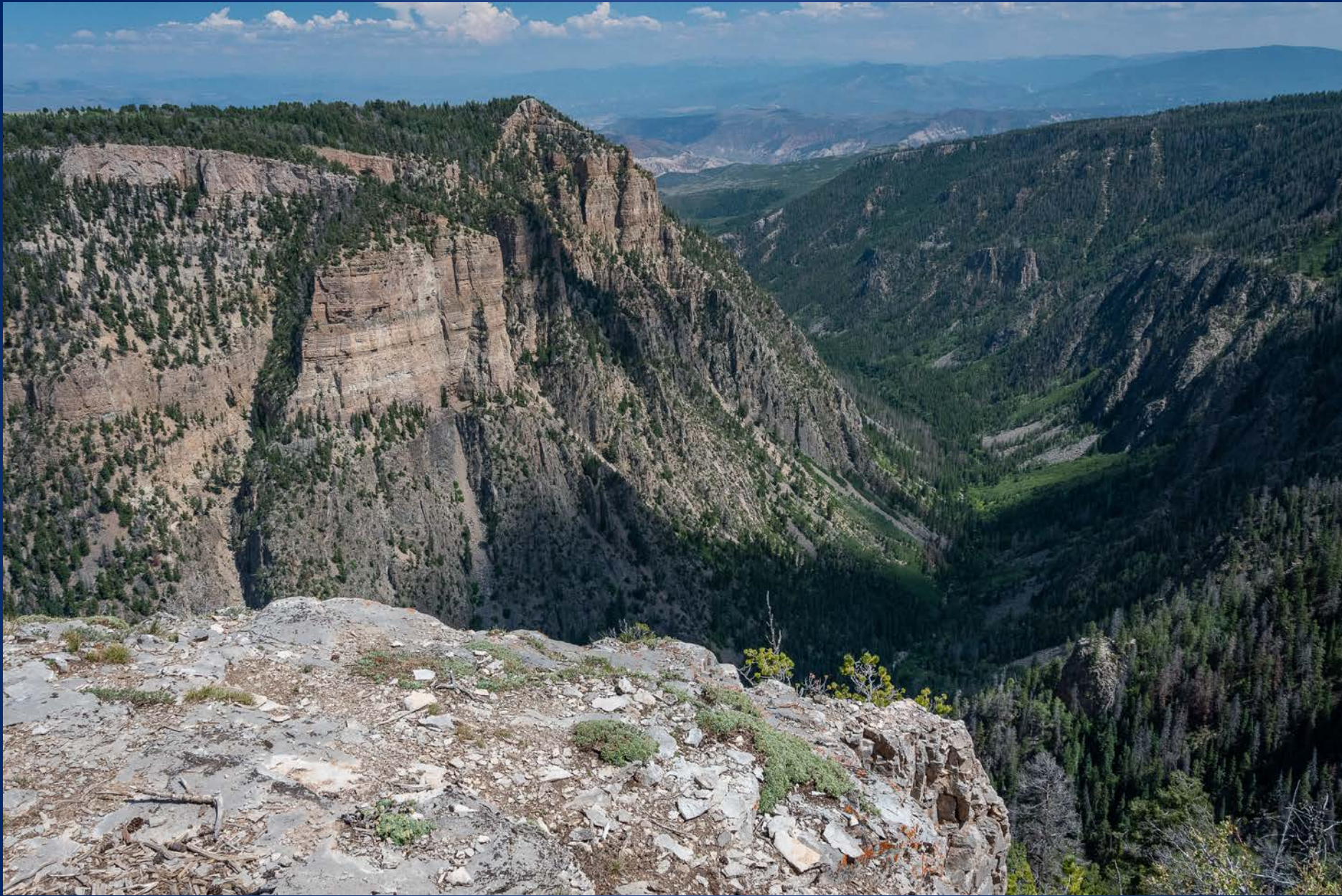
Looking SE from climbing area