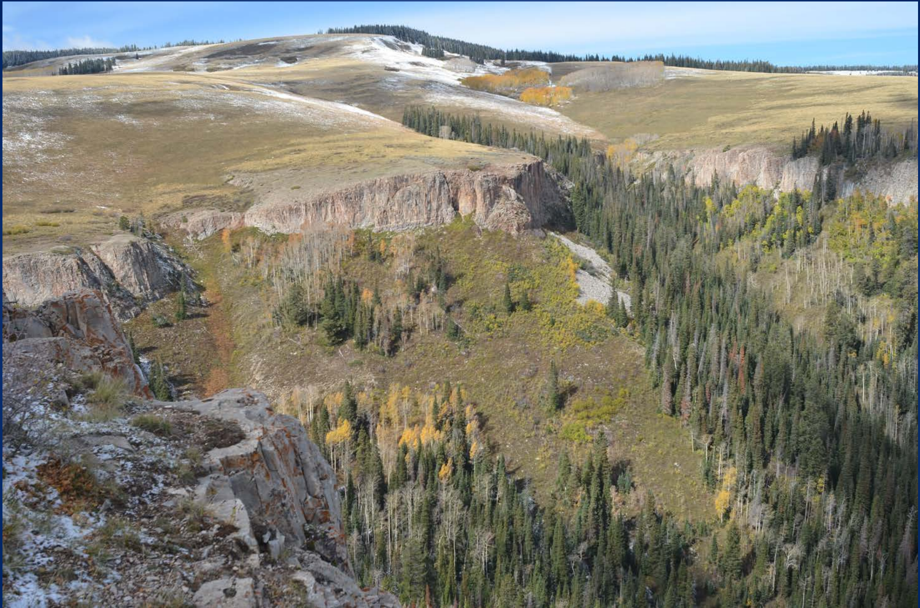
Looking West at Overlook