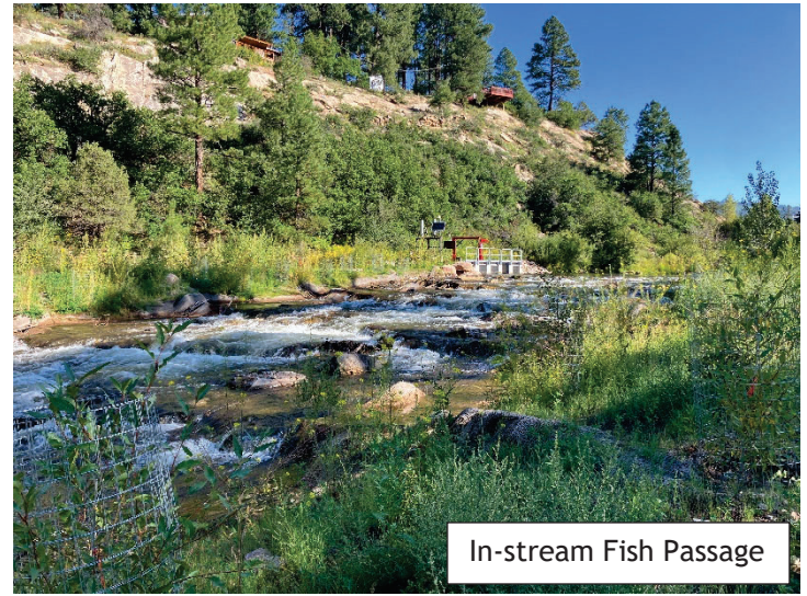
In-stream Fish Passage