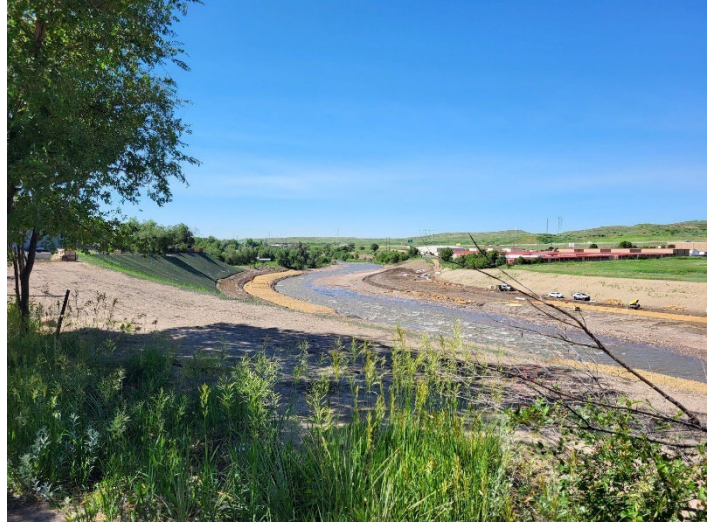
Project site at near-completion