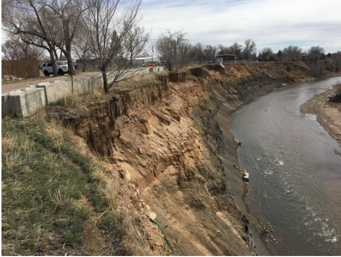
Project site before work