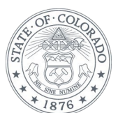
Exhibit C - Draft CWCB / Garfield County Agreement

Exhibit B - Draft CWCB / Ute Water Agreement