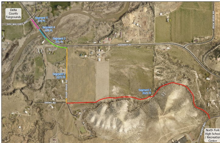
North Fork High School~Recreation Center Path to Fairgrounds Total Length ~6307 Ft

Colorado Water Plan grant funding will be used to construct Miners Trail of a hard compacted surface material that meets ADA guidelines. Is approximately 6,300' in length commencing from the North Fork High School and Crossroads Park and terminating on a planned interior trail at the County Fairgrounds, north of the Gunnison River, in the heart of downtown Hotchkiss. Delta County has already reached agreements on all trail land and rights-of-way for public access.