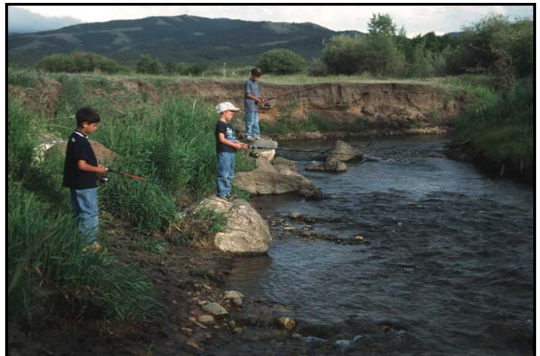
Photo of Trinchera Creek