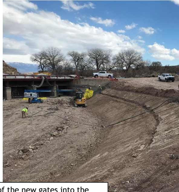
Right: Installation of one of the new gates into the Gunnison River Diversion Structure Left: Grading of the Power Canal