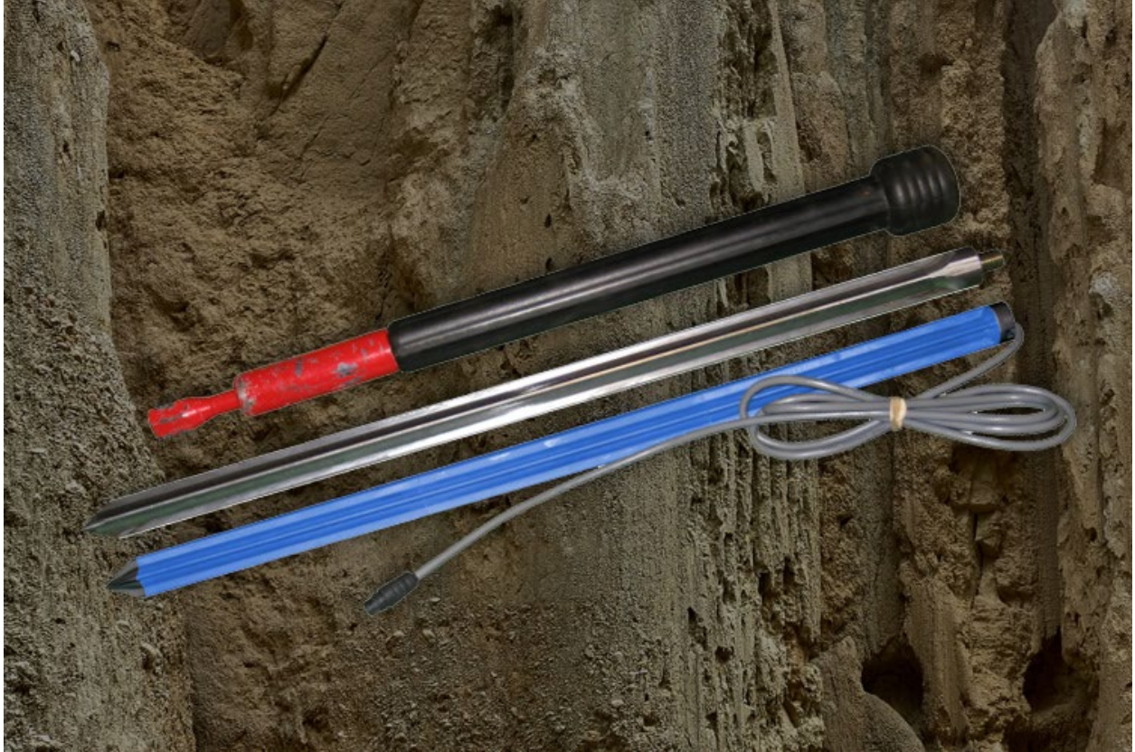
Figure 3: Soil Moisture Probes to be Implemented on the Demonstration Plots