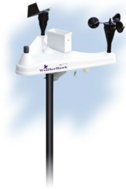
Figure 2: Weather Stations to be Implemented on the Demonstration Plots