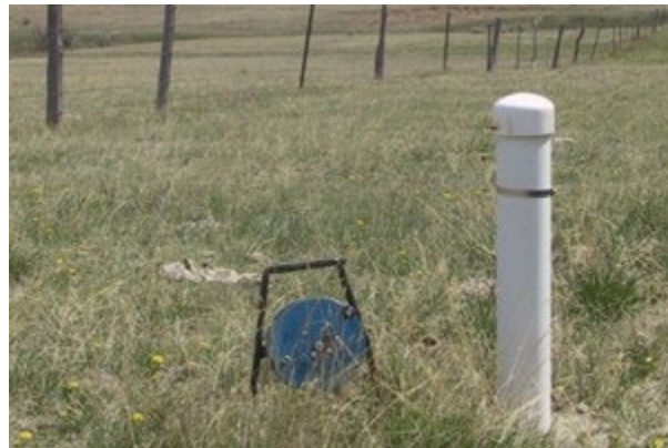
Figure 4: Artesian Wells to be Implemented on the Demonstration Plots