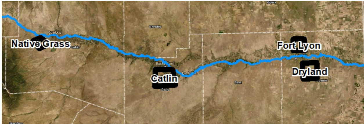
Figure 1: Map of Identified Areas for Demonstration Plots