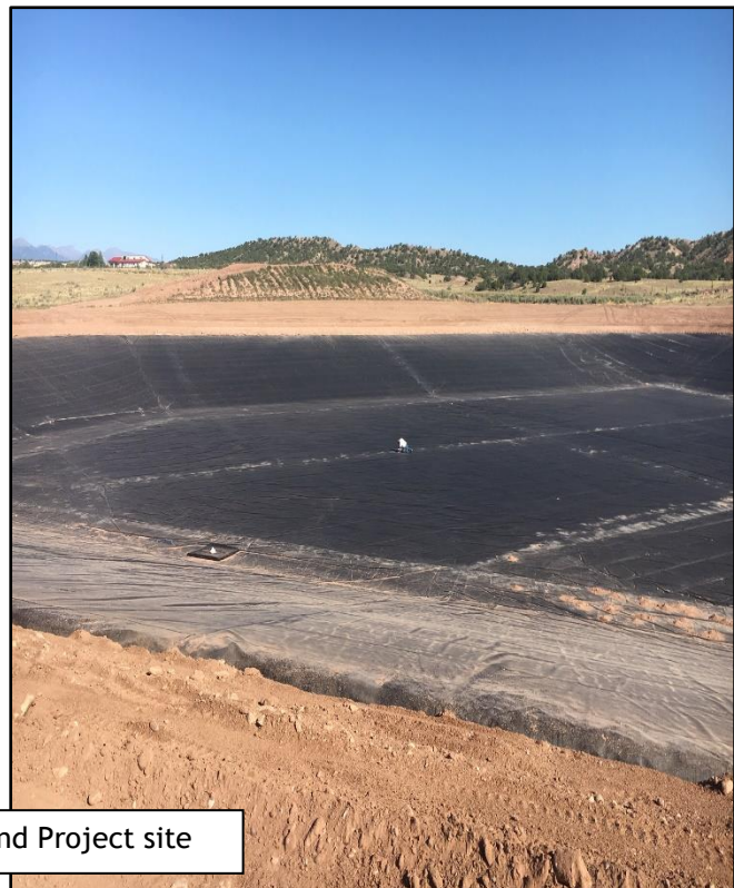
Sheep Mountain Regional Augmentation Pond and Project site