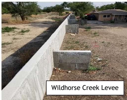
Wildhorse Creek Levee