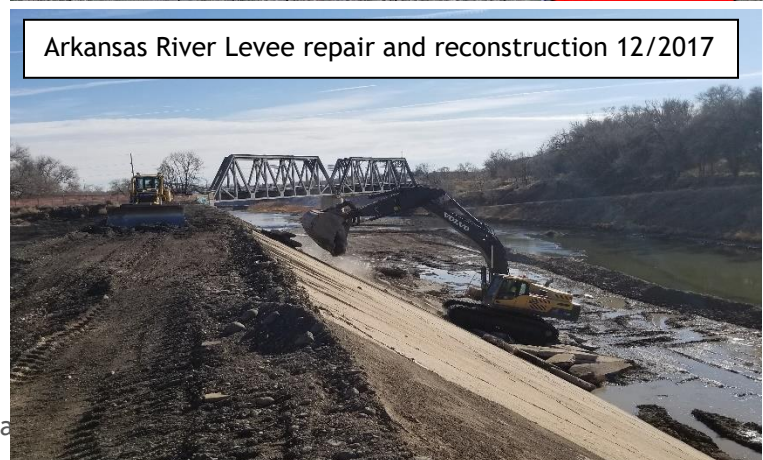
Arkansas River Levee repair and reconstruction 12/2017