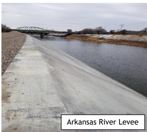
Arkansas River Levee