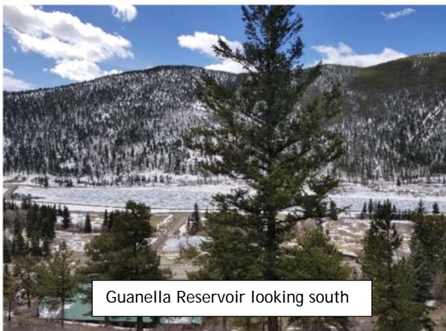
Guanella Reservoir looking south