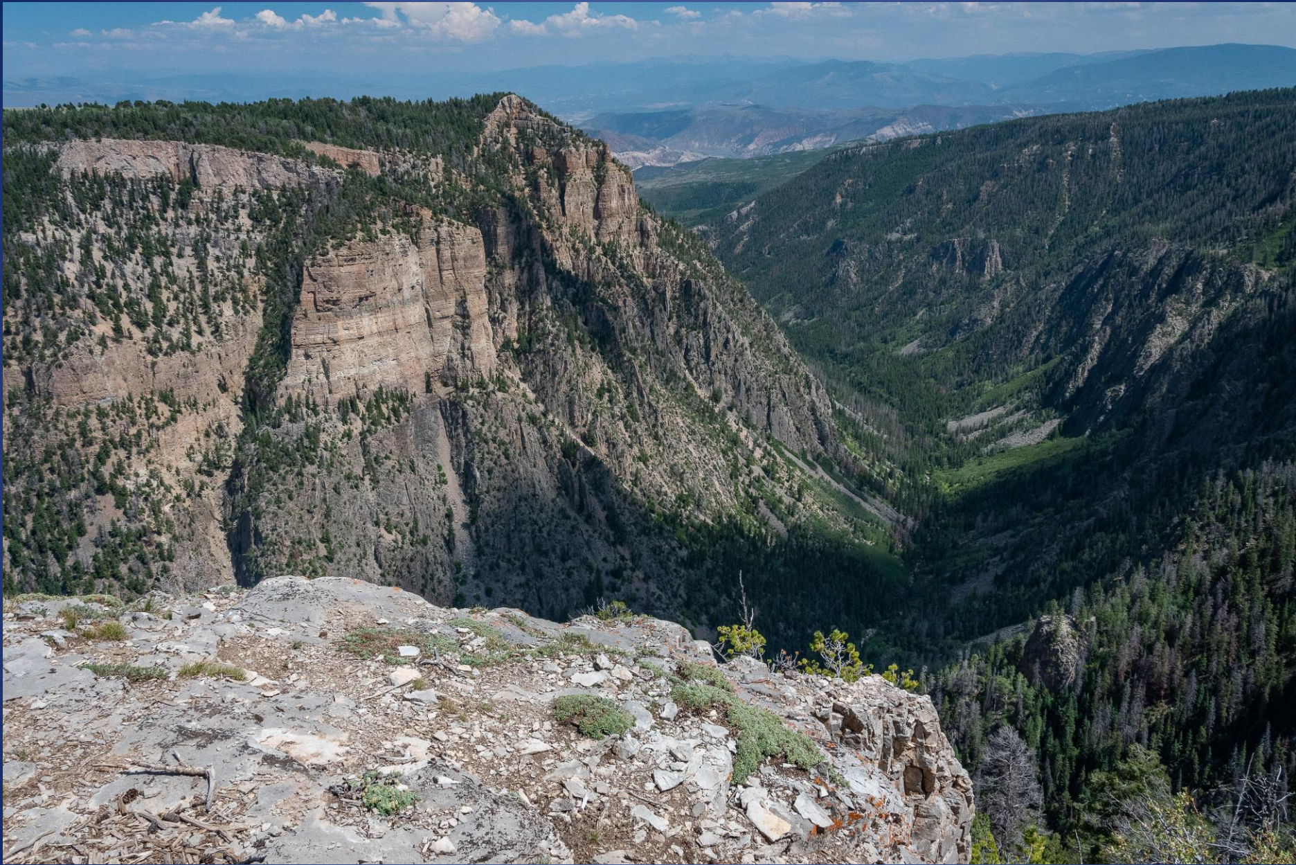
Looking SE from climbing area