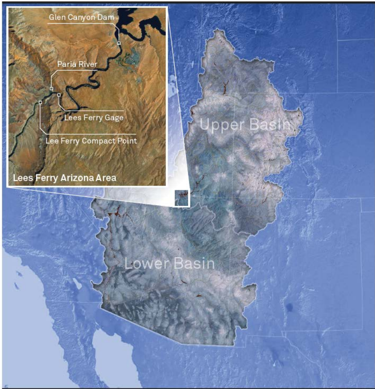
Figure 1 – Colorado River Basin and Important Locations near Lee Ferry

Figure 1 provides a reference to the physical arrangement of the important locations on the Colorado River relevant to the accounting of the cumulative flow requirement of the Colorado River Compact, in the context of the Colorado River Basin.