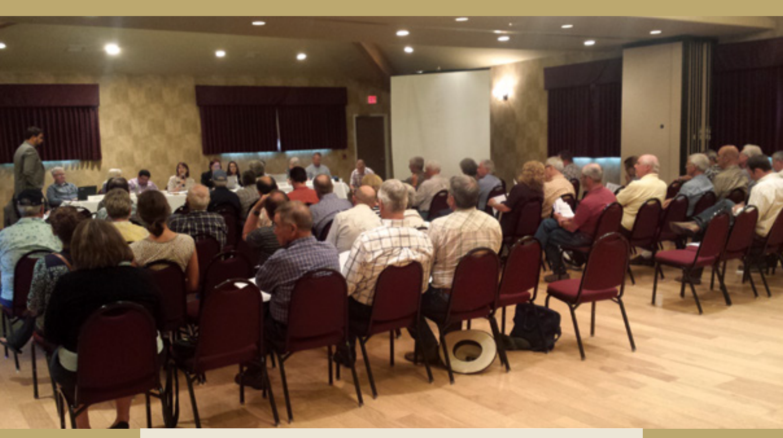
The General Assembly's Water Resources Review Committee conducting hearings on Colorado's Water Plan, which they did twice in each basin across the state during development of the plan.