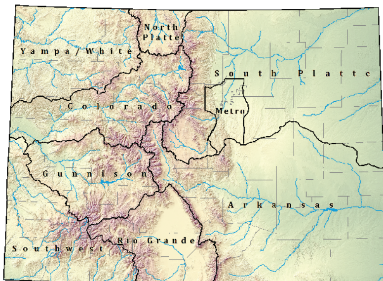
Colorado's Nine Basin Roundtables

This fact sheet defines the purpose of the Basin Implementation Plans, provides an overview of the technical assistance available to the basin roundtables for the Basin Implementation Plans, outlines the timeframes associated with this effort, and summarizes how this information will be utilized in the development of the SWSI Update and the Colorado Water Plan.