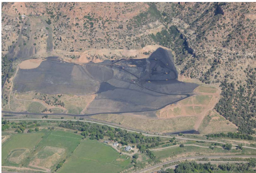
Refuse Areas #1, #4 and #2

Number of Partial Inspection this Fiscal Year: 3