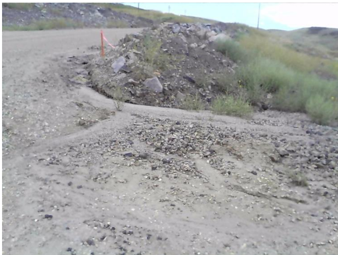
Runoff from Road D

The runoff to the south of Road D has deposited a heavy amount of sediment in and around ditch RC-D3. This area is in compliance with the approved plan; however will require a modification to address heavy precipitation events causing a build-up of sediment in this area.