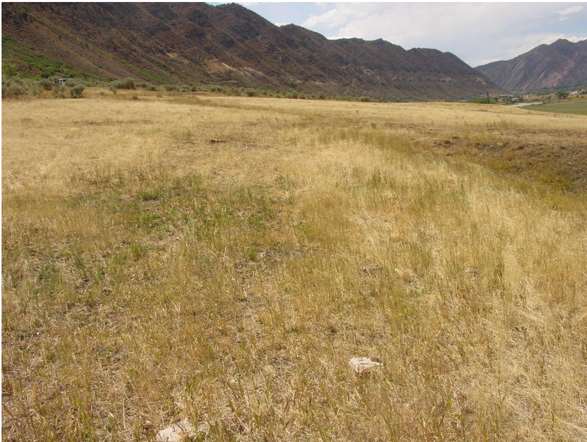
Reclaimed disturbance related to unapproved sediment ditch.

The unapproved ditch reclaimed in 2012 is well vegetated. No erosion was noted from the reseeded area.