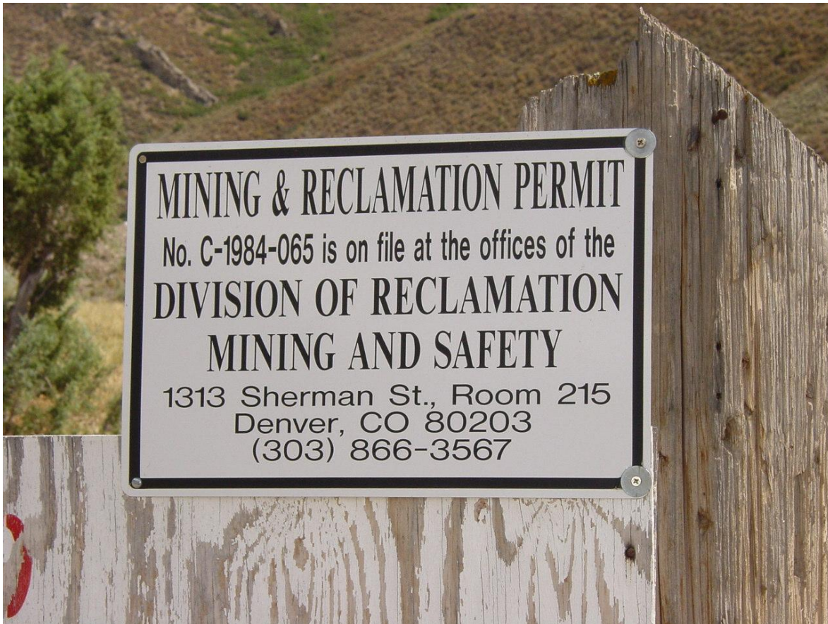
Mine ID sign.

Permit boundary markers were all visible and within light of sight from each other.