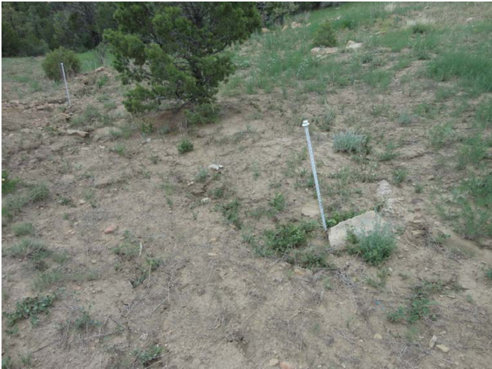
Photo 6: Disturbed area boundary showing erosion from NECC property, and erosion from neighbor below

Number of Partial Inspection this Fiscal Year: 0