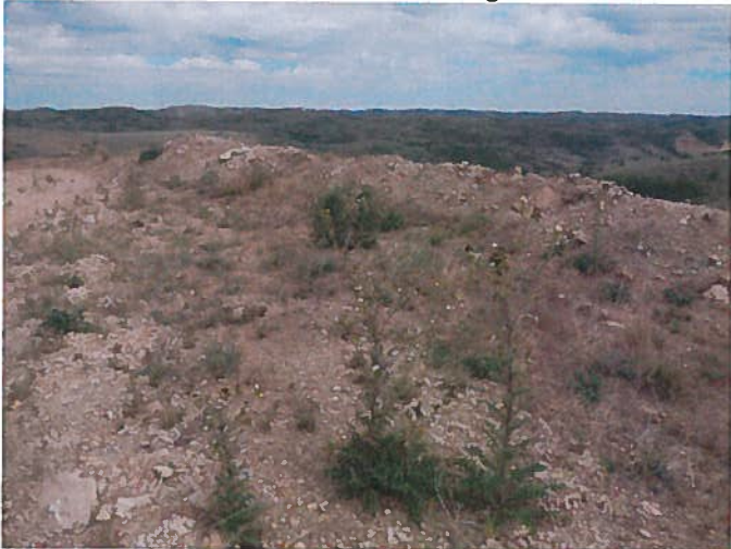
Canadian Thistle on site