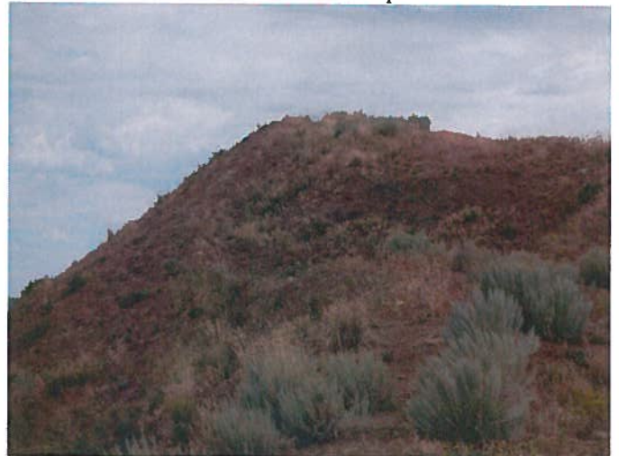
Topsoil Stockpile on northwestern portion of permit area