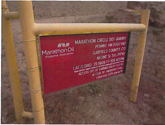
Permit Identification Sign