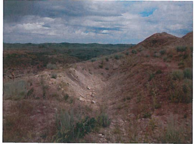
Stormwater retention pond