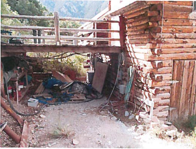
Figure 9: Cabin located on north side of FR 310