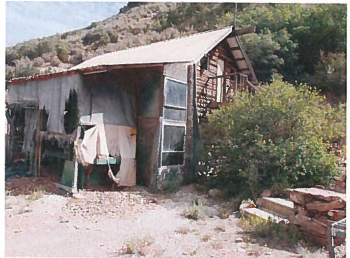
Figure 8: Cabin located on north side of FR 310