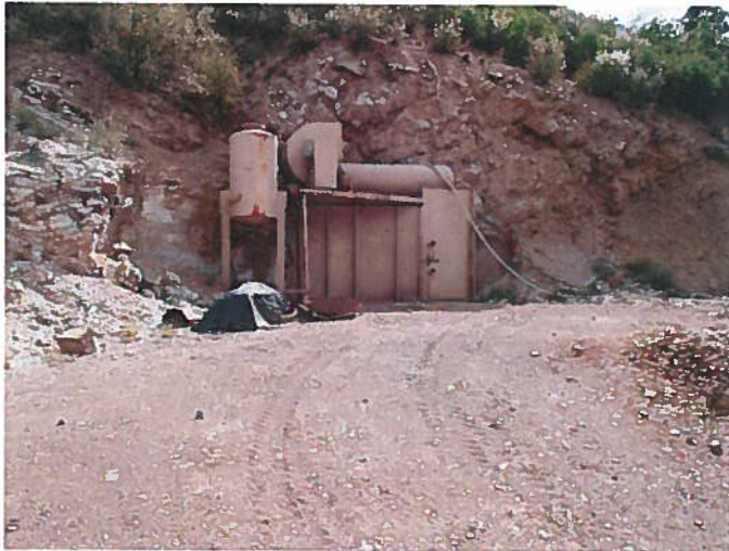
Figure 11: Portal entrance