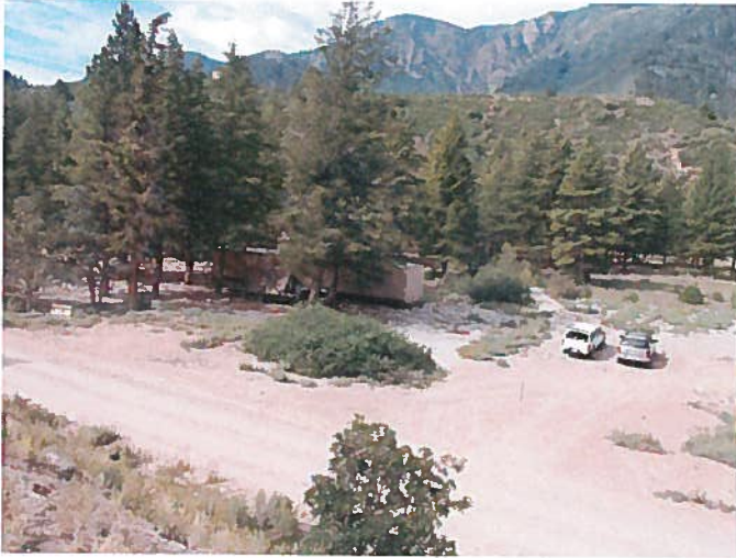
Figure 1: View of the bathhouse and parking area on the south side of FR 310