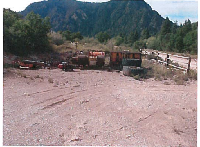
Figure 6: Equipment stored in south part of mine yard on north side of FR310