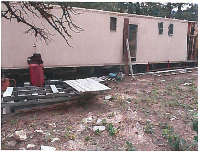
Figure 3: Bathhouse