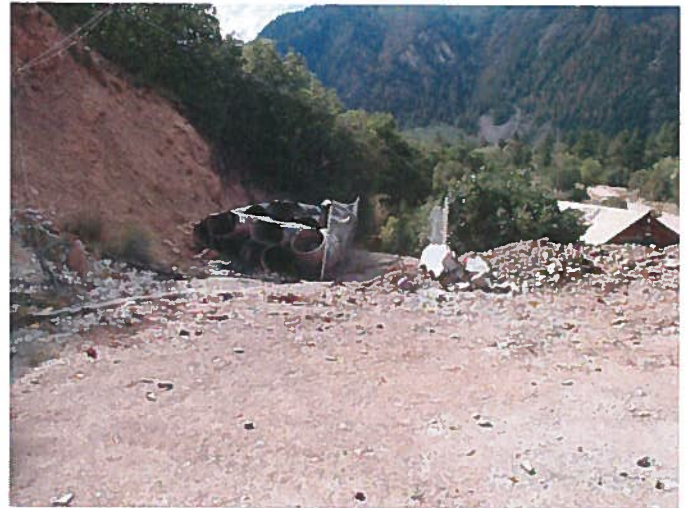
Figure 12: Vent pipe stored near portal entrance