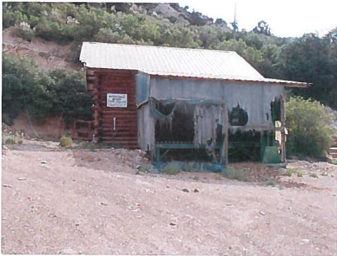
Figure 7: Cabin located on north side of FR 310