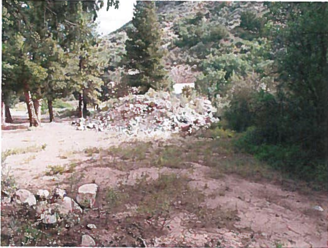
Figure 5: TR-2 material stockpiled in southeast part of conifer grove