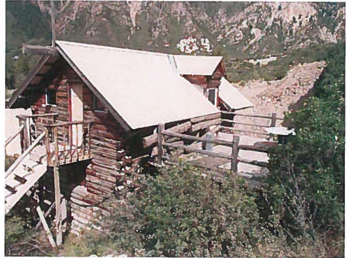
Figure 10: Cabin located on north side of FR 310