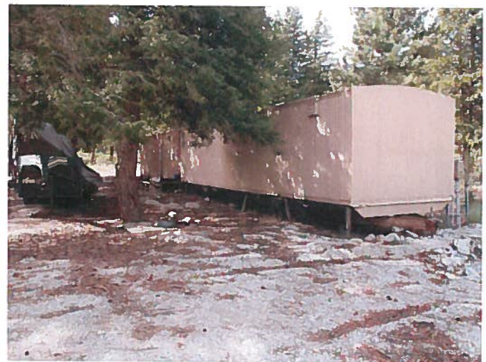
Figure 4: Bathhouse