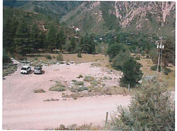
Figure 2: View of the parking and work/storage area on the south side of FR 310