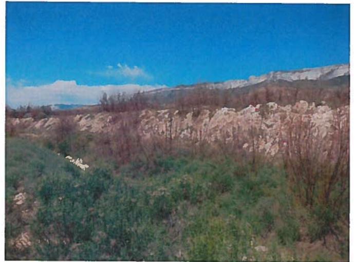
Approved berm on west side of site. Tamarisk not living