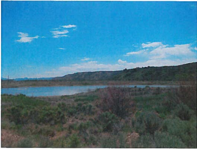
Overall Site, looking East