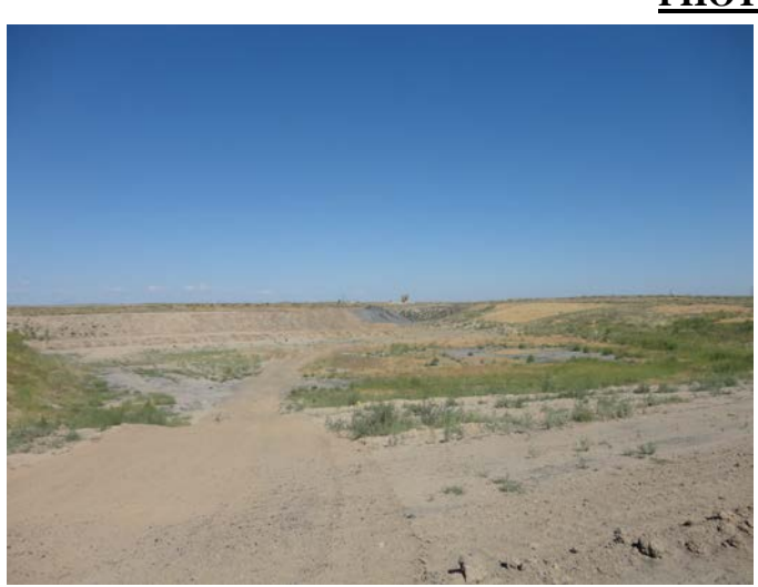
Open area of B-Pit, north end