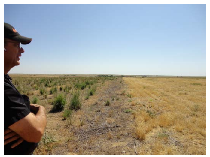
Parcel 30 on left, Parcel 29 on right