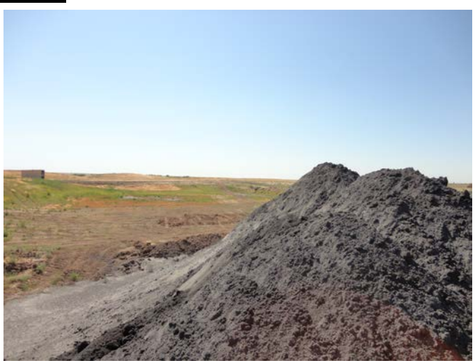
Ash disposal in B-Pit

Number of Partial Inspection this Fiscal Year: 1 Number of Complete Inspections this Fiscal Year: 0