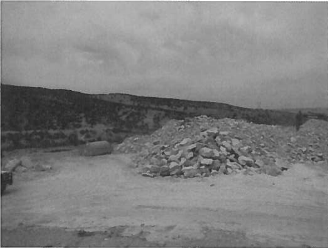
Looking at site NW