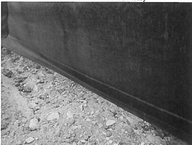
Portions of silt fence not adequately installed