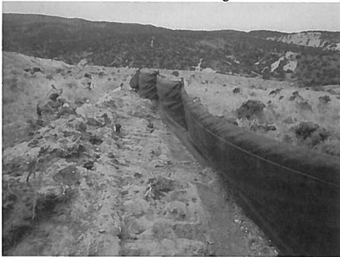
Silt Fence on Northern Boundary