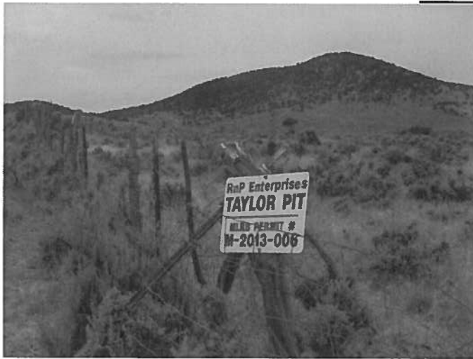
Mine Identification Sign