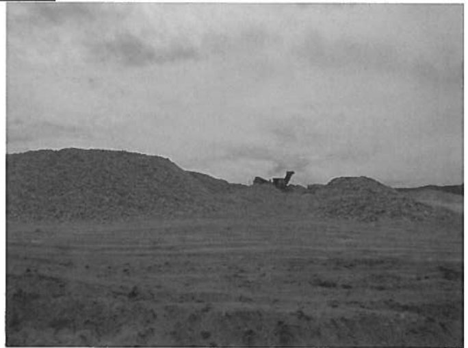
Screened Limestone Material