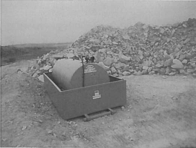
Fuel Tank on site