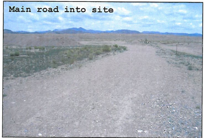
Main road into site