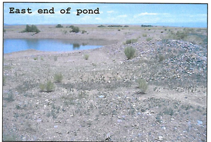
East end of pond