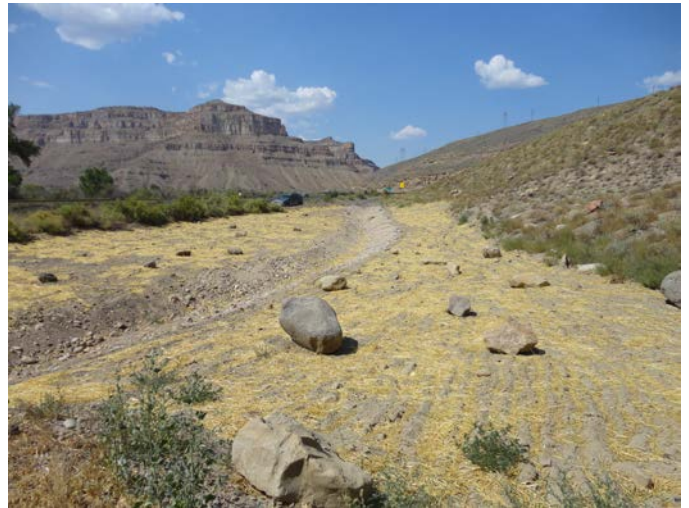
Pond 9 Reclamation