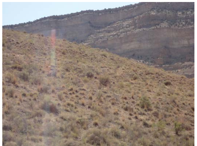
CRDA #1/#2 Reclamation

Number of Partial Inspection this Fiscal Year: 1