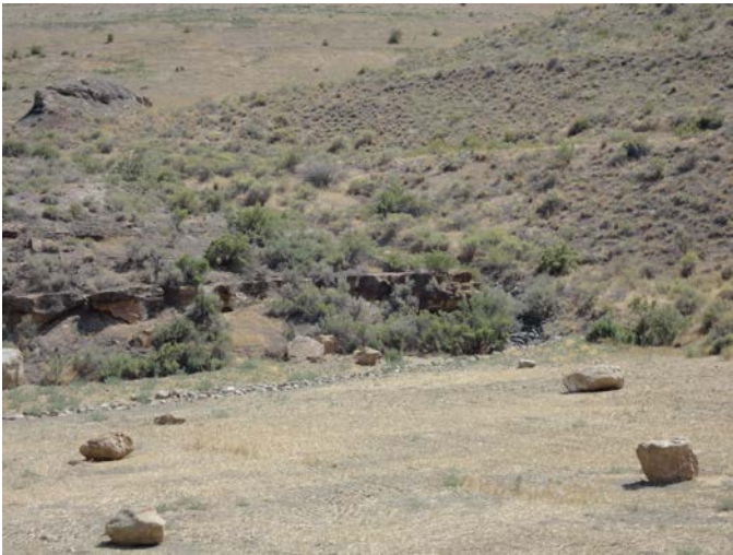
Pond 10 Reclamation