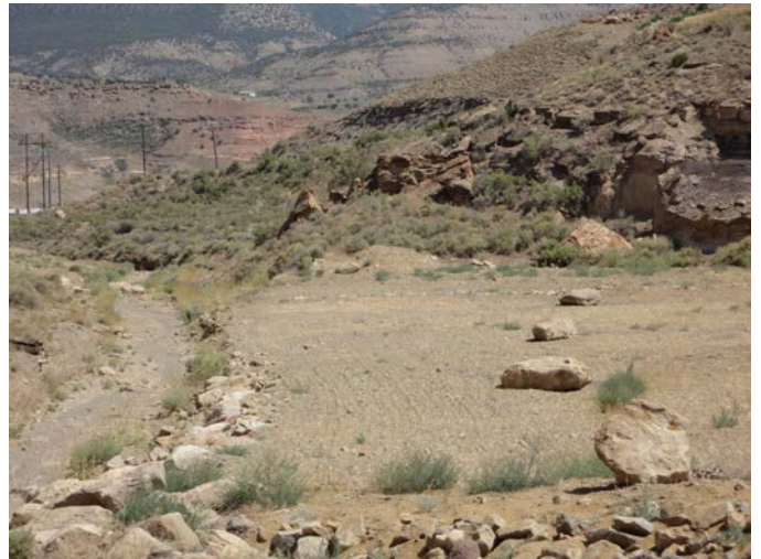
Pond 6 Reclamation