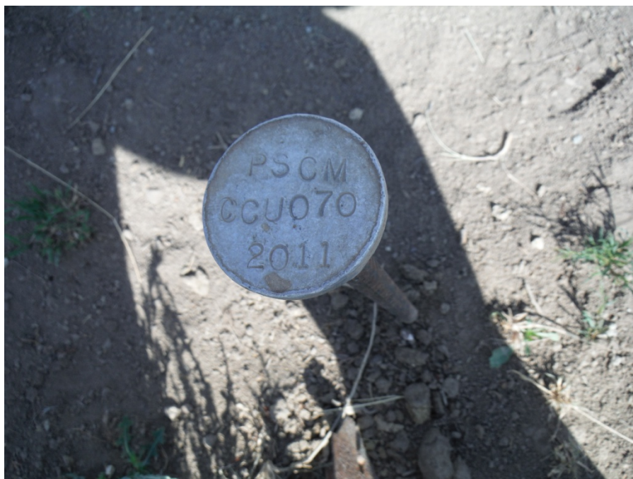
Borehole marker at CCU070

Number of Partial Inspection this Fiscal Year: 0