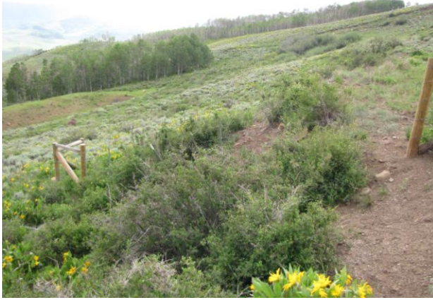
Photo 3- Fence was in Good Condition