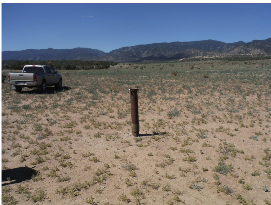
BC-02, monitoring well remains

Number of Partial Inspection this Fiscal Year: 0