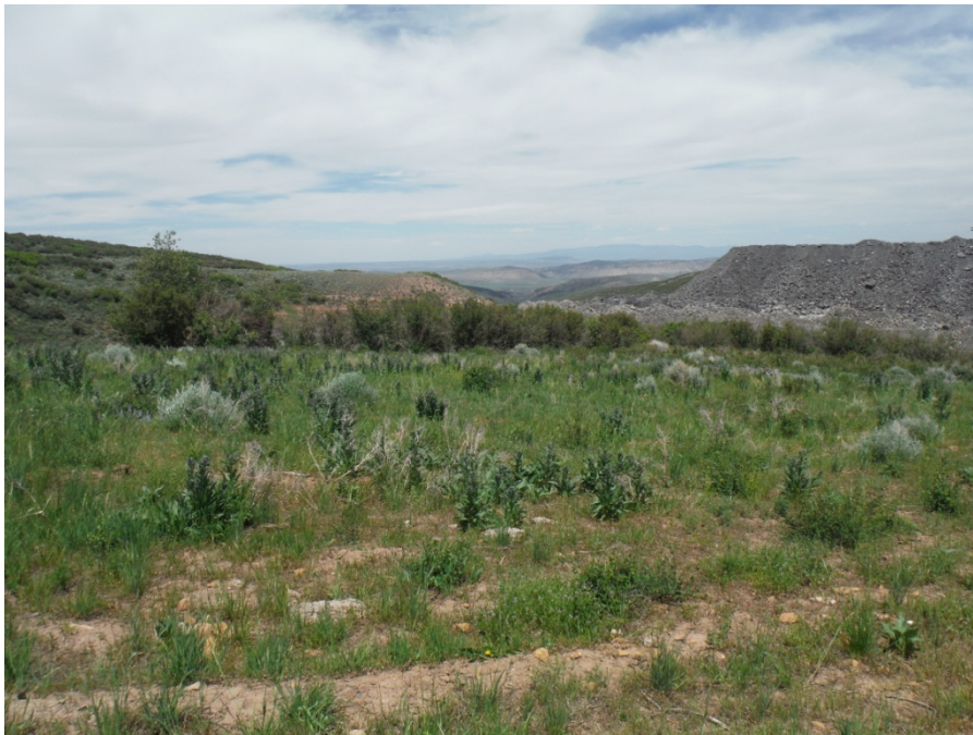
ST-07-01, Houndstongue dominates reclaimed pad