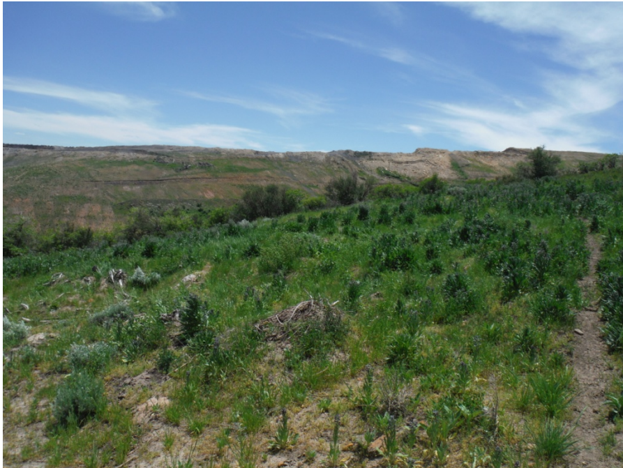
ST-07-03, Houndstongue dominates reclaimed pad

Number of Partial Inspection this Fiscal Year: 0