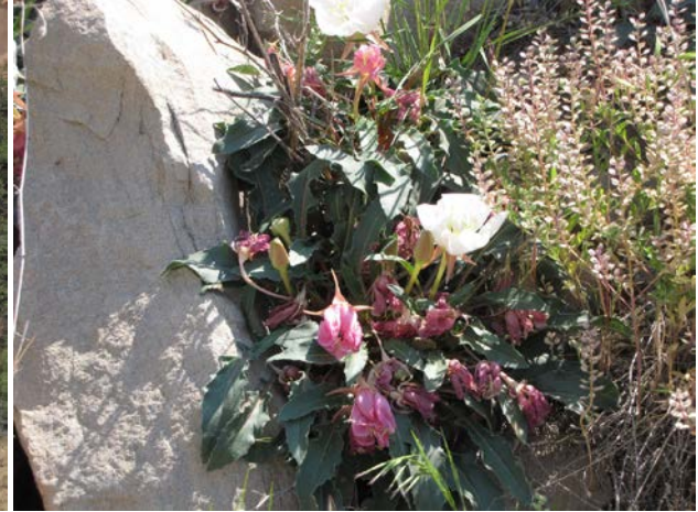
Photo 8 - Oenothera caespitosa