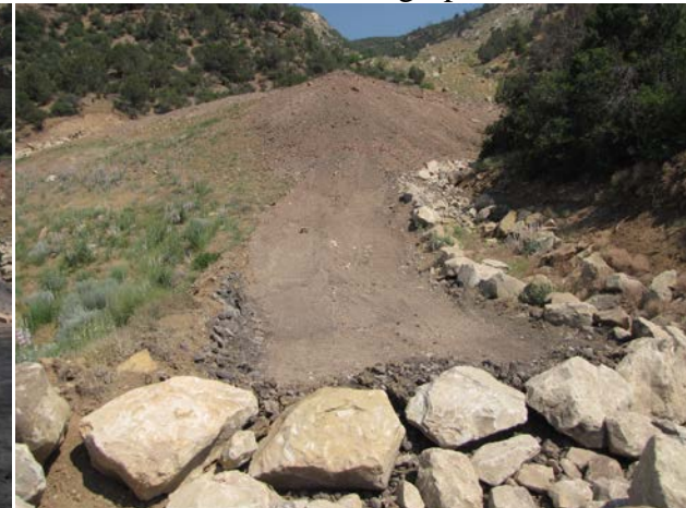
Photo 6 - II West Refuse Pile Lower Access Road

Number of Partial Inspection this Fiscal Year: 11