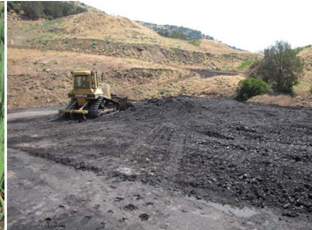
Photo 4 - Coal Waste Being Spread Into a Lift