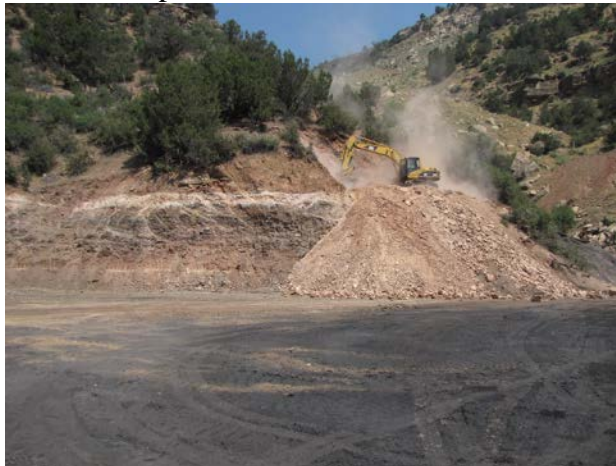
Photo 5 - Removing Soil From Hillside