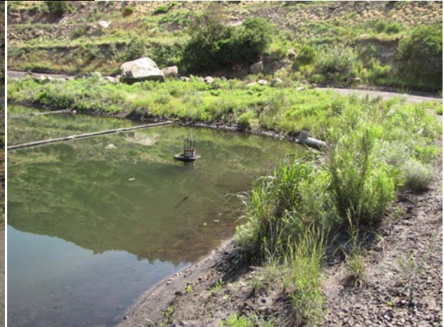
Photo 2 - Pond D