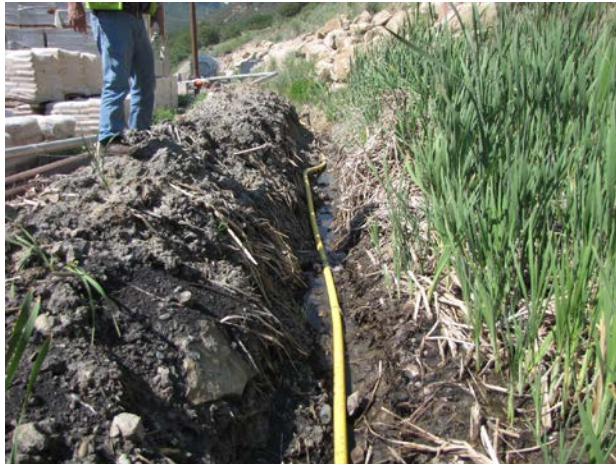
Photo 3 - Pipe in Ditch D-6