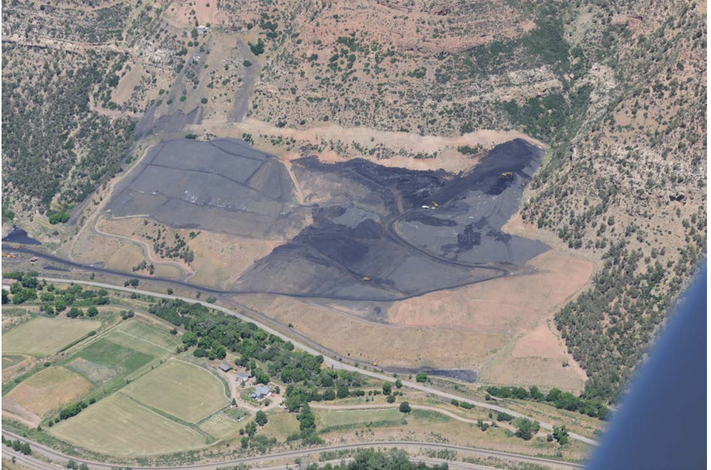
Gob Piles #1, #2, #3, and #4.

Number of Partial Inspection this Fiscal Year: 15