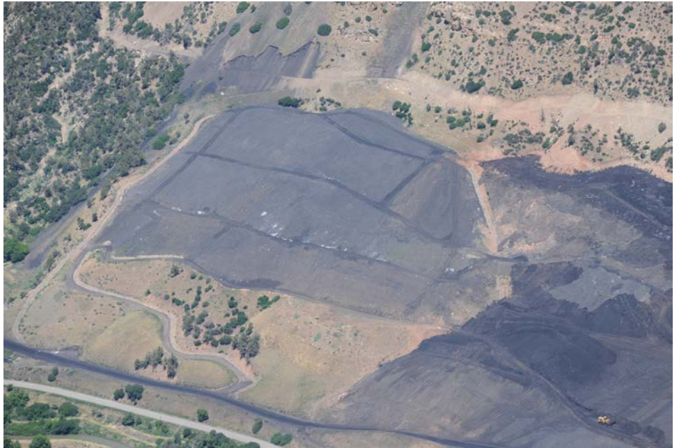
Gob Pile #4