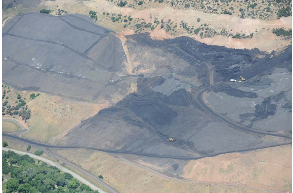
Expansion area between Gob Piles #2 and #4