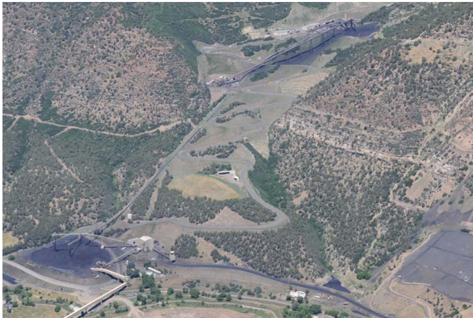
Main Facilities and haul road

Number of Partial Inspection this Fiscal Year: 15