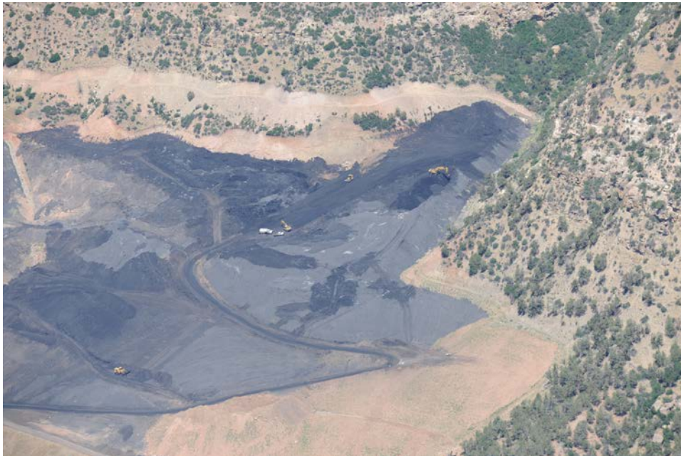
Gob Pile #2

Number of Partial Inspection this Fiscal Year: 15