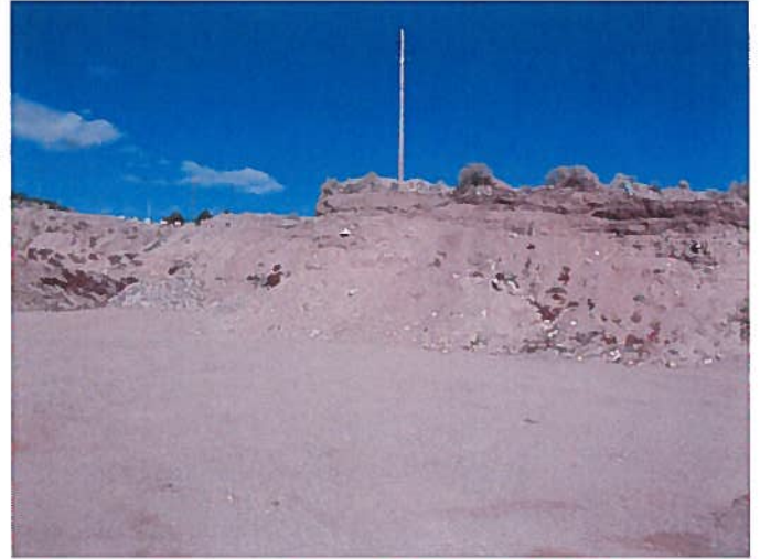
Figure 2: View toward the west side of the pit.