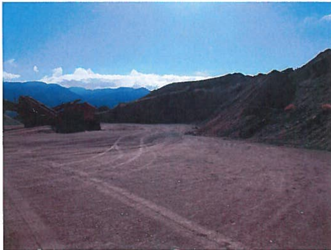
Figure 3: View toward the east side of the pit.