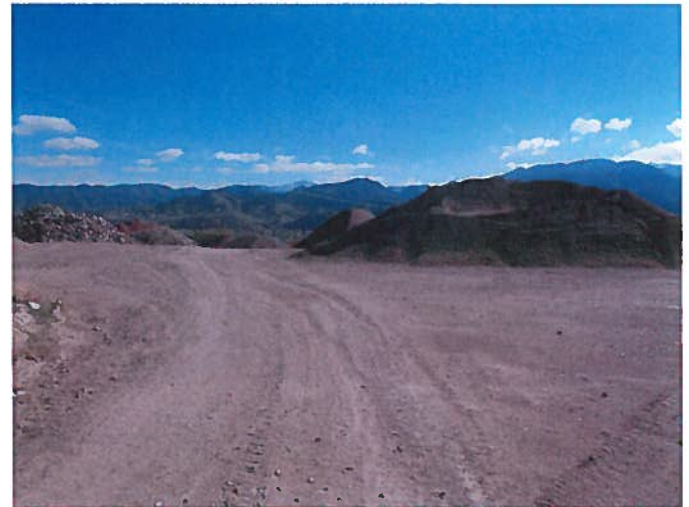
Figure 4: View of the east part of the pit, facing north.