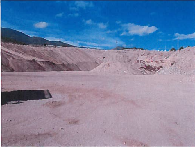
Figure 1: View toward the highwall where slope reduction has commenced, in the southwest part of the pit.