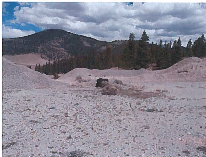
Figure 2: Stockpile Area