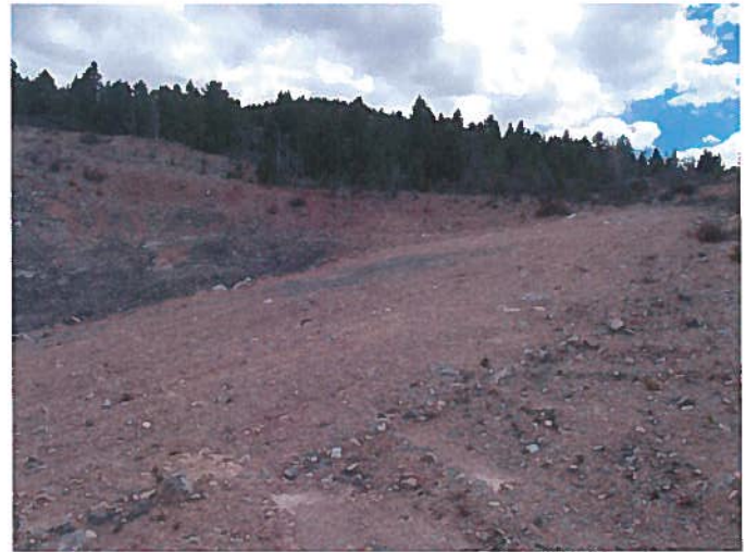
Figure 8: Mining Area B

Daniell Wieber Colorado Lien Company P.O. Box 440 Rapid City, SD 57709