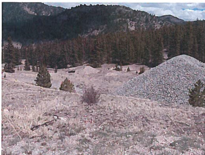
Figure 1: Stockpile Area