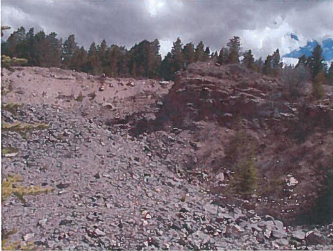
Figure 5: Mining Area B