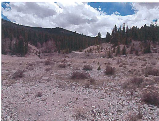
Figure 4: Stockpile Area