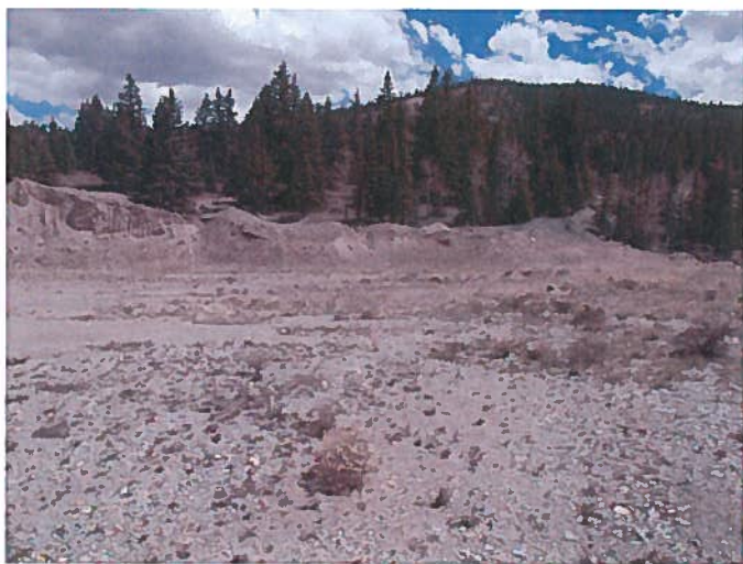
Figure 3: Stockpile Area