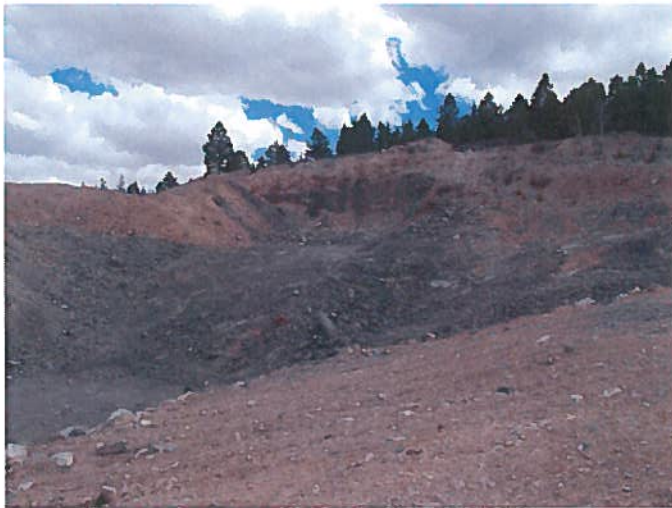
Figure 7: Mining Area B