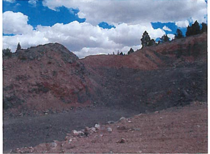
Figure 6: Mining Area B