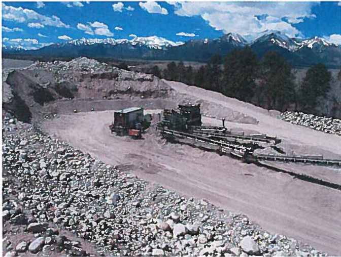
Figure 3: View toward the south end of the pit, from the east rim of the pit.