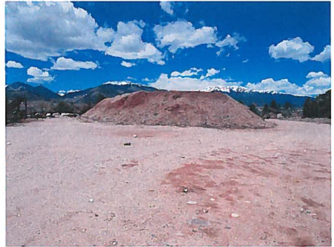
Figure 4: Topsoil stockpile located on the north side of the pit.