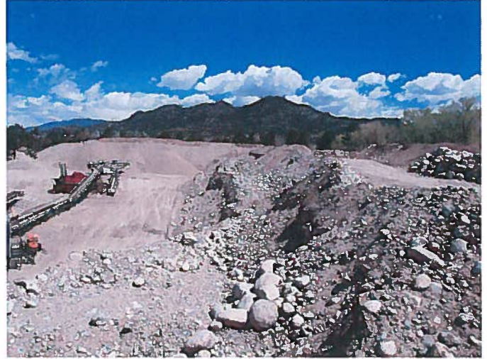
Figure 2: View from the south side of the pit, facing north.