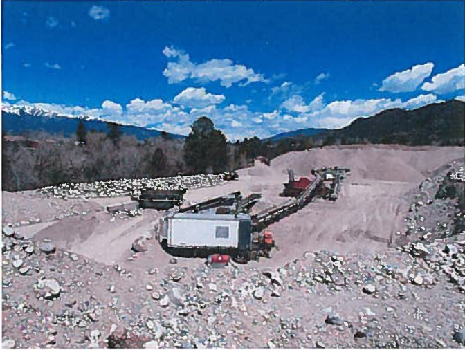
Figure 1: View from the south side of the pit, facing north.