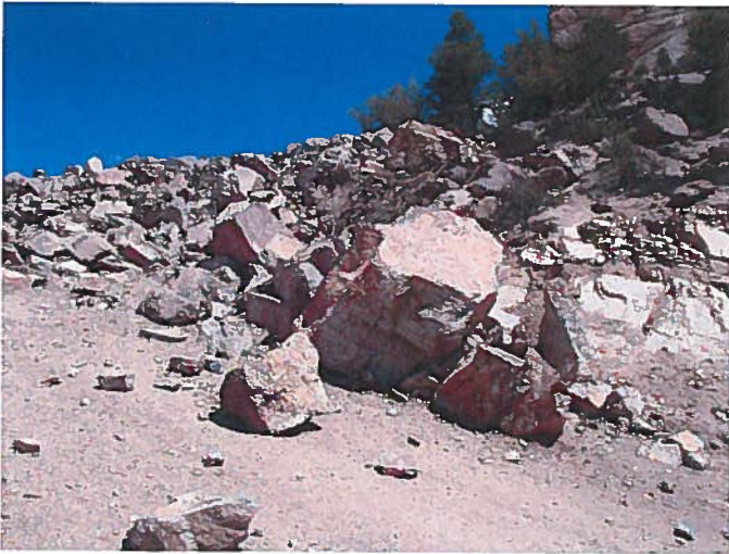
Figure 3: View of upper quarry area, facing east.