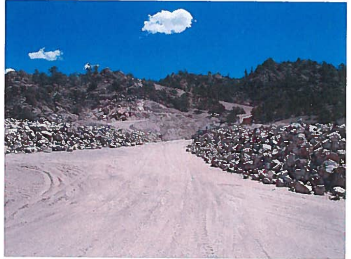
Figure 2: View of storage pad and lower quarry area, facing east.