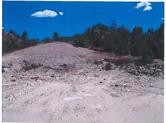
Figure 4: View of upper quarry area, facing east.