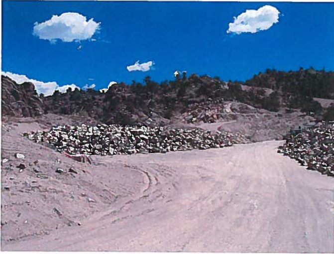
Figure 1: View of storage pad and lower quarry area, facing east.