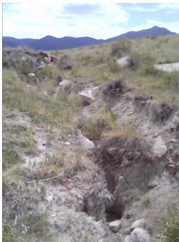
Photo 4: Gully between West Pit and East pit at north Extent (south of access road)

Number of Partial Inspection this Fiscal Year: 0