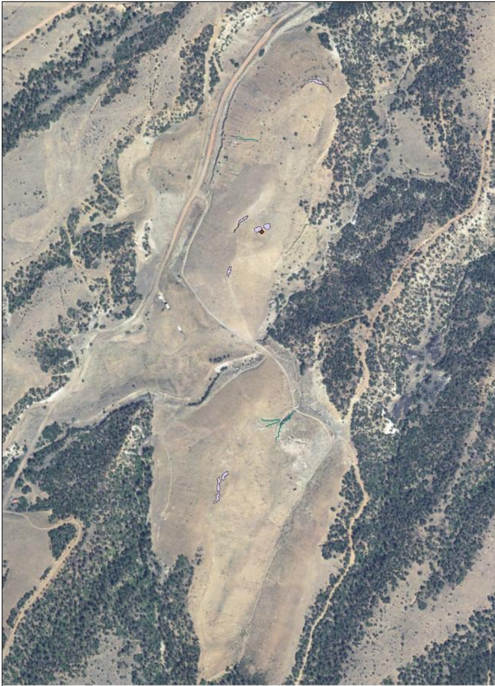
Chen's Hill, West Pit and East Pit

Number of Partial Inspection this Fiscal Year: 0