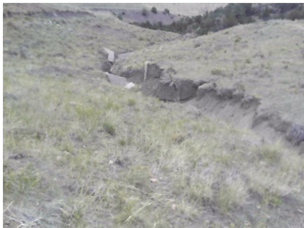
Photo 5: gully located north of access road with broken concrete check dams