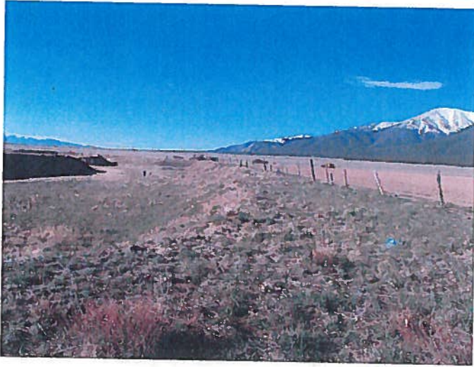
Figure 1: View, facing south, from northwest corner of property.