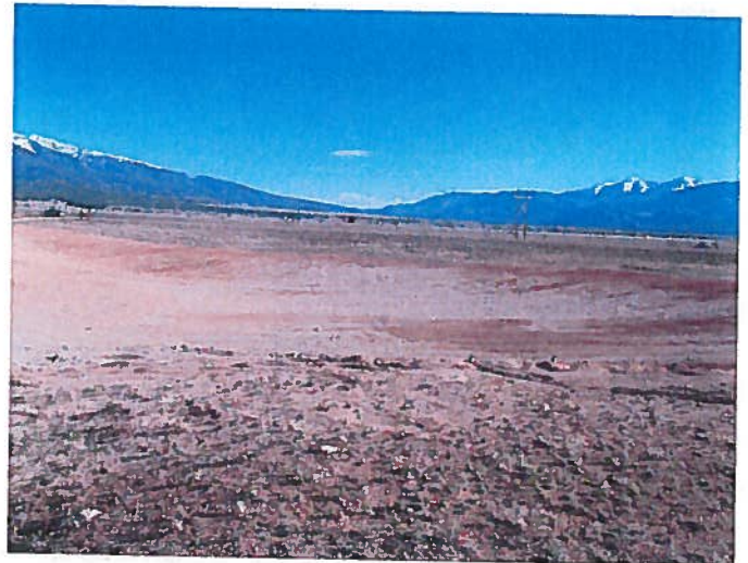
Figure 4: View, facing northwest, from southeast side of pit.

Joe Nelson Chaffee County P.O. Box 699 Salida, CO 81201