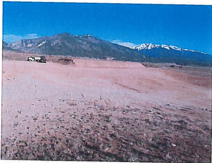
Figure 3: View, facing northwest, from southeast side of pit.