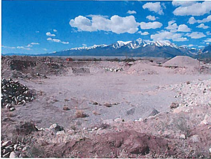
Figure 9: View, from east rim of the northeast pit, facing west.