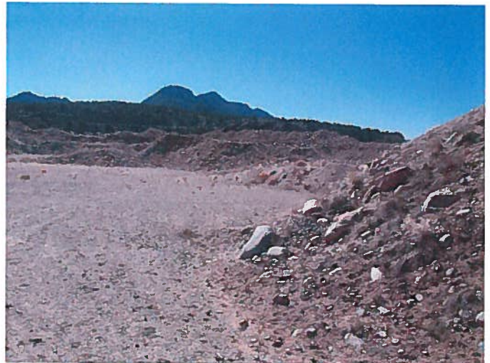
Figure 8: View, facing south, toward the south highwall of the northeast pit.