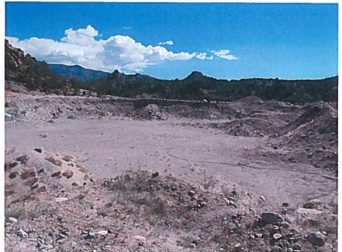
Figure 10: View, from the west rim of the northeast pit, facing east.