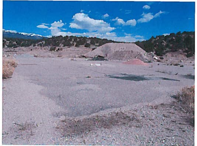
Figure 2: Asphalt pad. Topsoil stockpile is shown just beyond the pad.