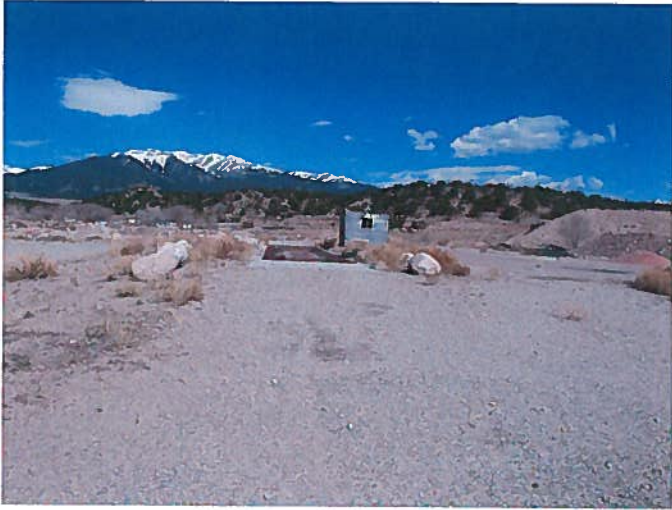
Figure 1: Scale and scale house. The asphalt pad is located on the right side of the scale house.