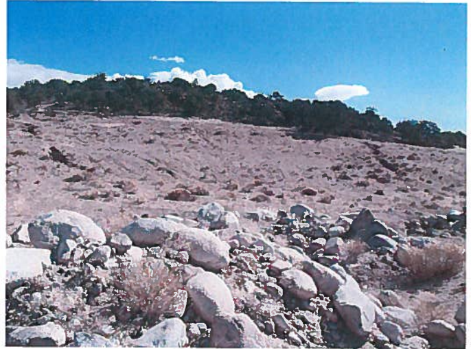
Figure 6: View toward the northeast part of the north slope in the northwest pit area. Significant gullies are forming on this part of the slope.