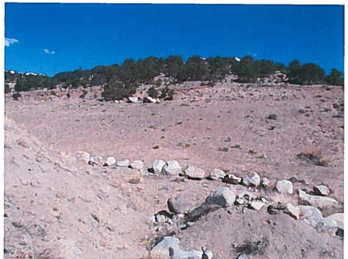
Figure 4: View toward the north slope in the northwest pit area. This part of the slope appeared stable and vegetation was becoming established.