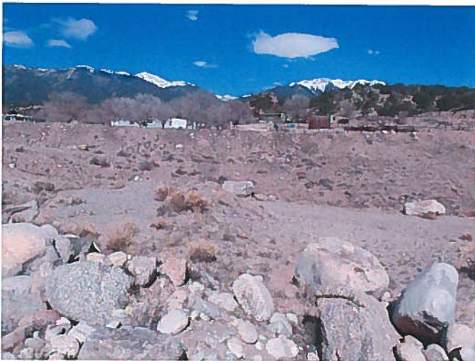
Figure 3: View toward the northwest slope in the northwest pit area. The slope appeared stable and vegetation was becoming established.