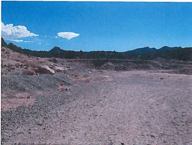
Figure 7: View, facing east toward the northeast pit, from the access road that leads from the northwest pit.