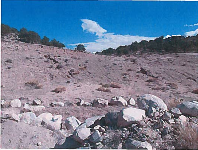
Figure 5: View toward the northeast part of the north slope in the northwest pit area. Significant gullies are forming on this part of the slope.