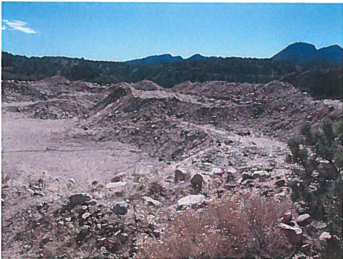
Figure 11: View, from the west rim of the northeast pit, facing east.