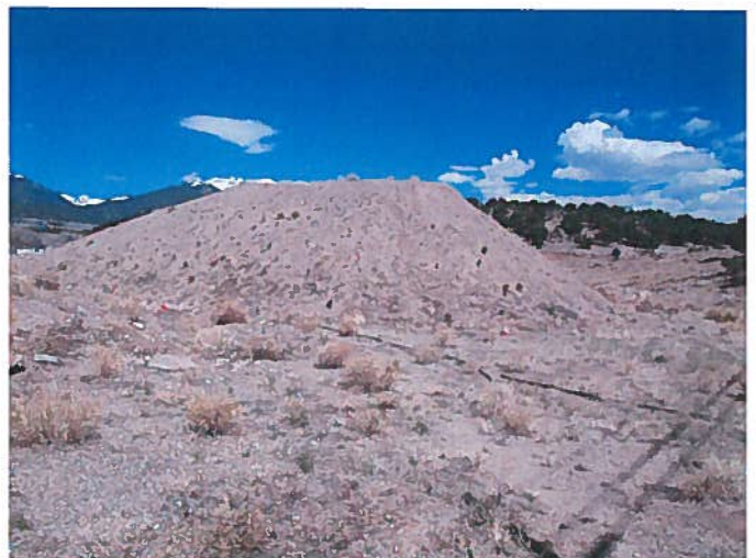
Figure 12: Topsoil stockpile located at the north side of the asphalt pad.