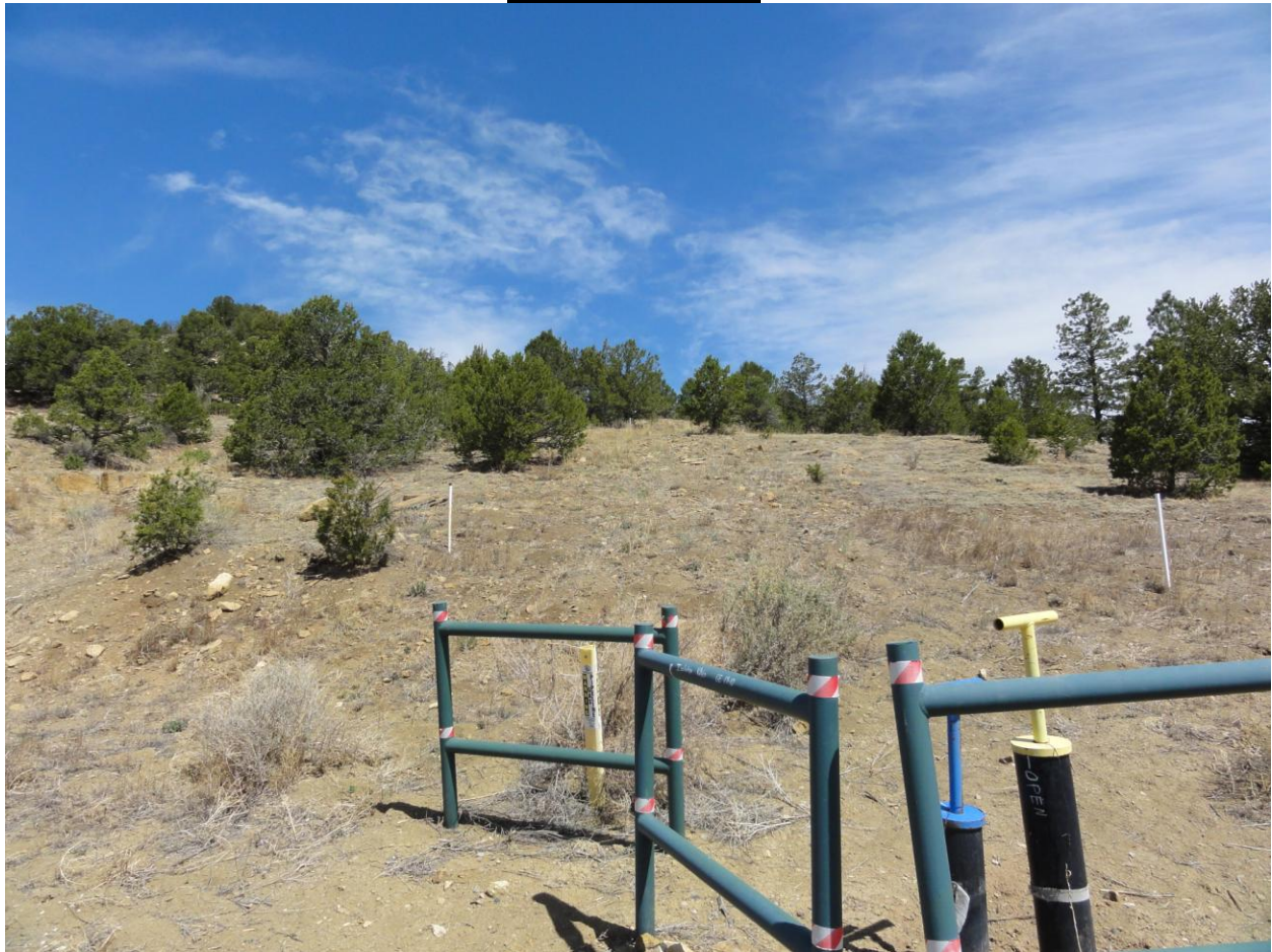
Golden Eagle Mine site

Number of Partial Inspection this Fiscal Year: 7