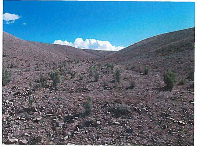
Figure 2: Location for proposed access road.