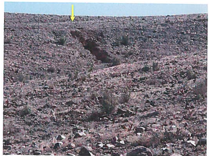
Figure 8: Gullies forming beneath existing access road.

Bob Kalenak Delta County 501 Palmer Street Delta, CO 81416