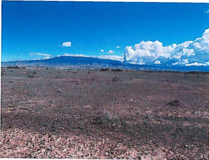
Figure 5: View from the old air strip facing north.