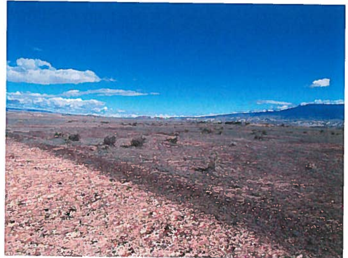
Figure 6: View from the old air strip facing northwest.