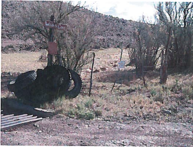
Figure 1: Entrance to the site from 25 Mesa Road.