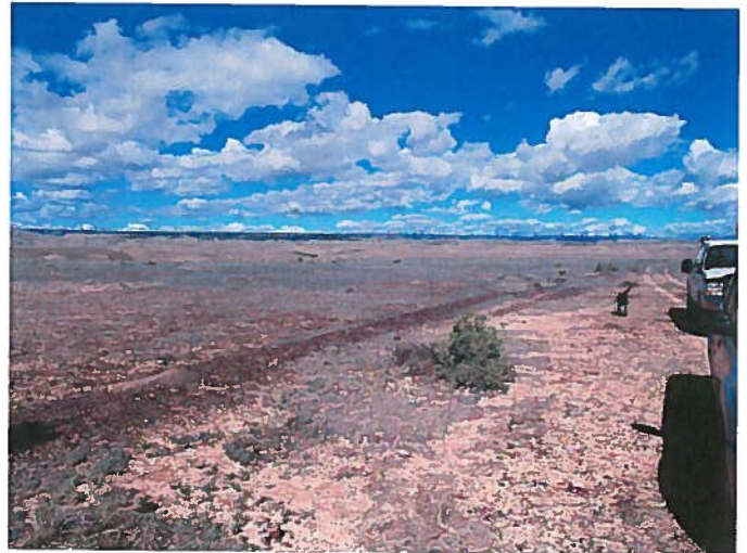
Figure 4: View from the old air strip facing west.