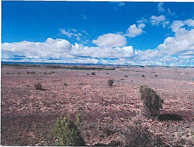
Figure 3: View from the old air strip facing southwest.