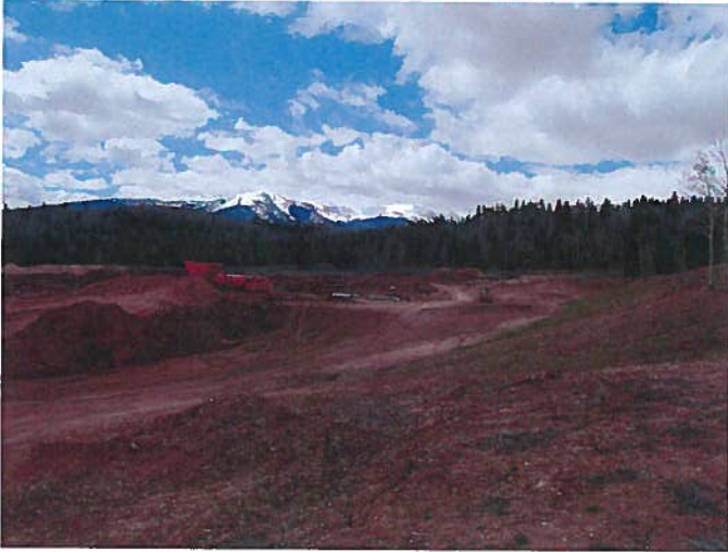
Figure 1: View from the north end of the USFS slope, facing southwest.