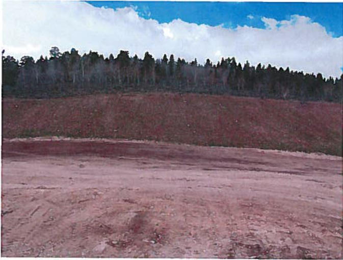
Figure 9: Reclaimed USFS slope.