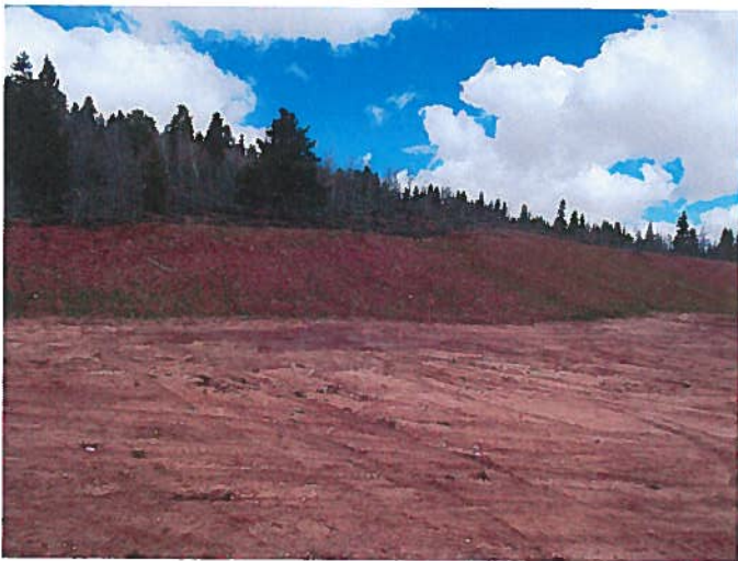
Figure 7: Reclaimed USFS slope.