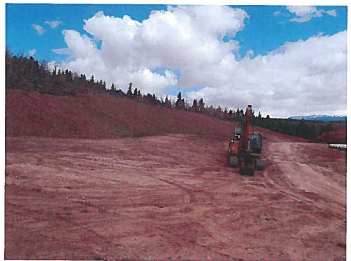
Figure 8: Reclaimed USFS slope.