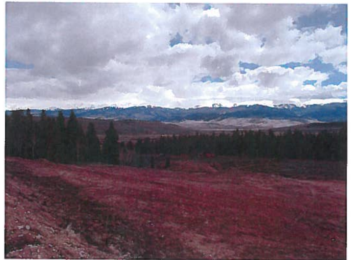
Figure 4: View from the north end of the USFS slope, facing northeast.