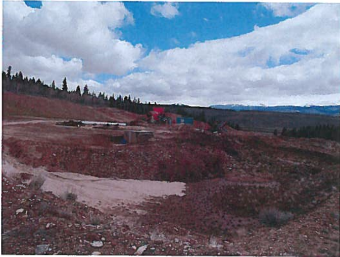
Figure 5: View from the south side of the processing area, facing north.