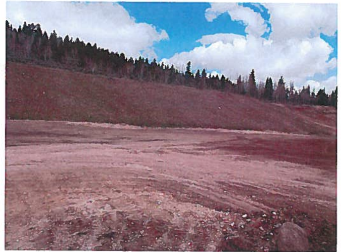
Figure 10: Reclaimed USFS slope.