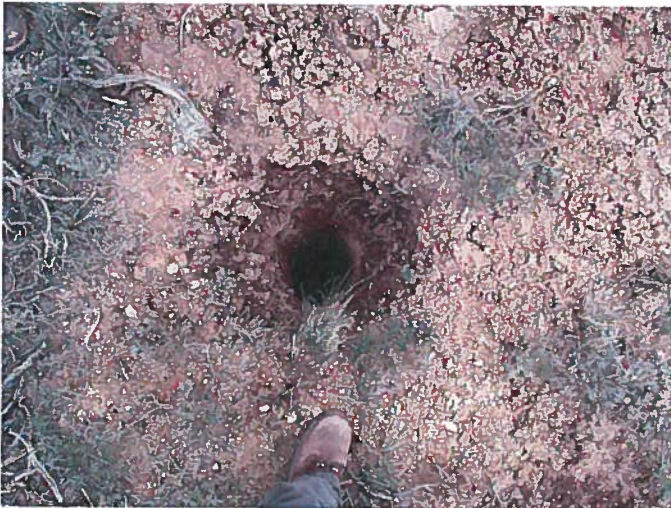
Figure 11: Unreclaimed auger hole located just beyond the stormwater berm on the northeast side of the disturbed area.