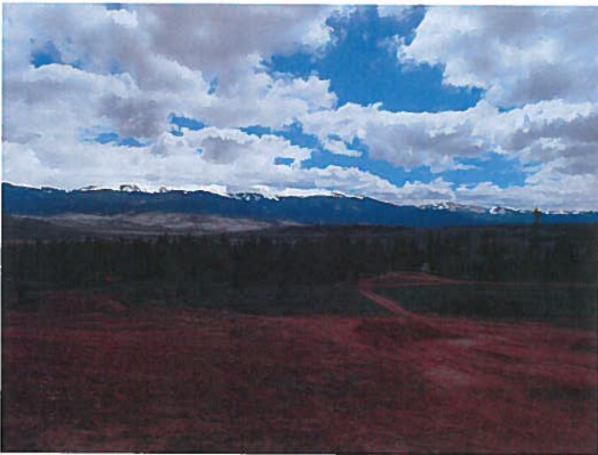
Figure 3: View from the north end of the USFS slope, facing east.