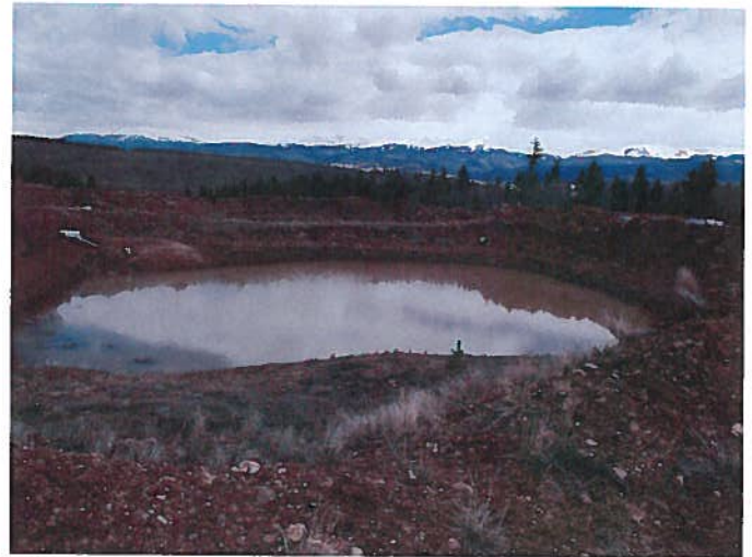
Figure 6: View from the south side of the processing area, facing north.