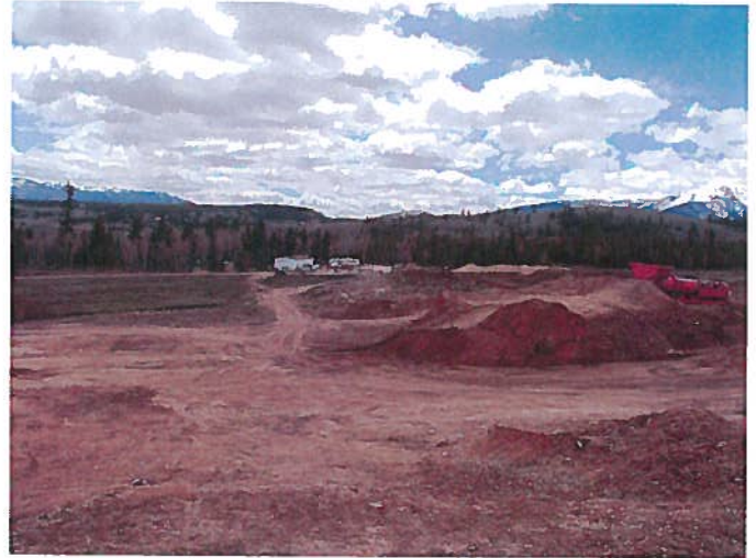
Figure 2: View from the north end of the USFS slope, facing southeast.