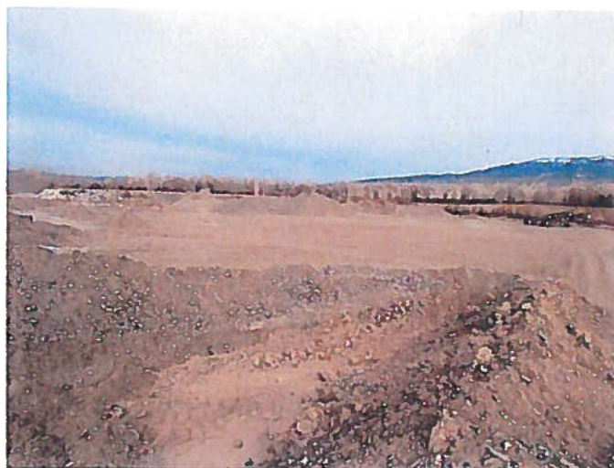
Figure 2: View from the southeast side of the Phase 1 pit, facing northwest.