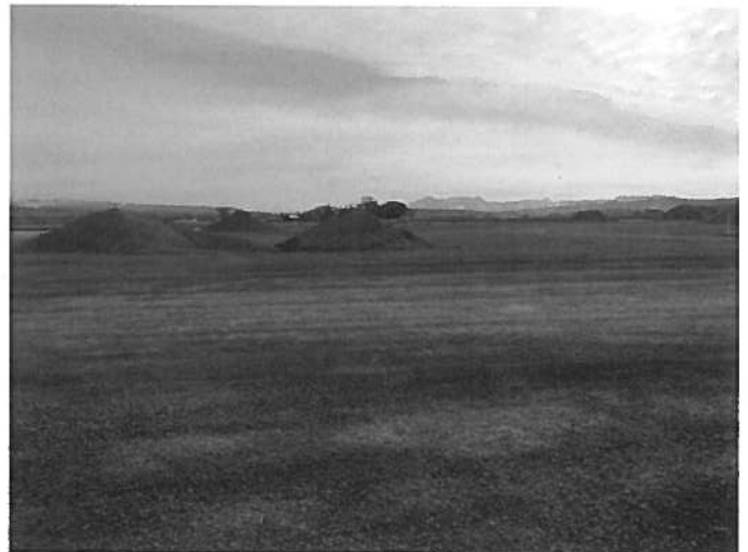
Figure 6: Phase 11 area, on the north side of the Ready Mix plant, facing east.