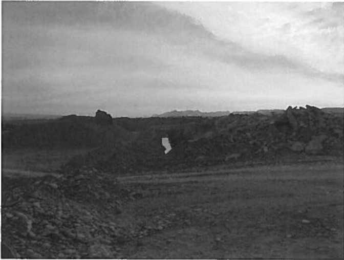
Figure 5: View from the west side of the Phase 1 pit, facing east. Tamarisk have begun to infest the dewatering trenches.