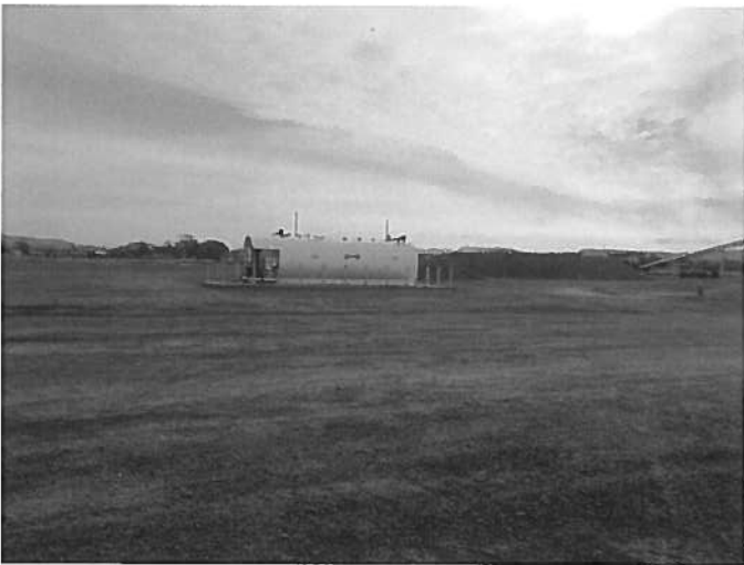
Figure 7: Phase 11 area, on the north side of the Ready Mix plant, facing east.