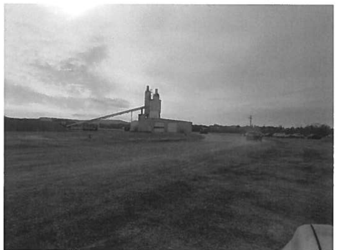
Figure 8: Ready Mix plant in the Phase 11 area.