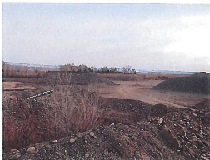
Figure 4: View from the west side of the Phase 1 pit, facing northeast. Tamarisk have begun to infest the dewatering trenches.