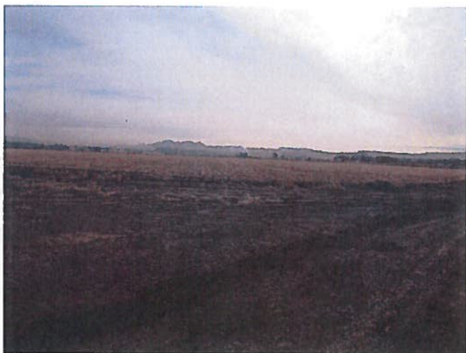
Figure 3: View from the southeast side of the Phase 1 pit, facing east toward Phase 2-4 areas.