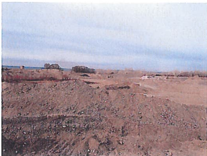
Figure 1: View from the southeast side of the Phase 1 pit, facing west.