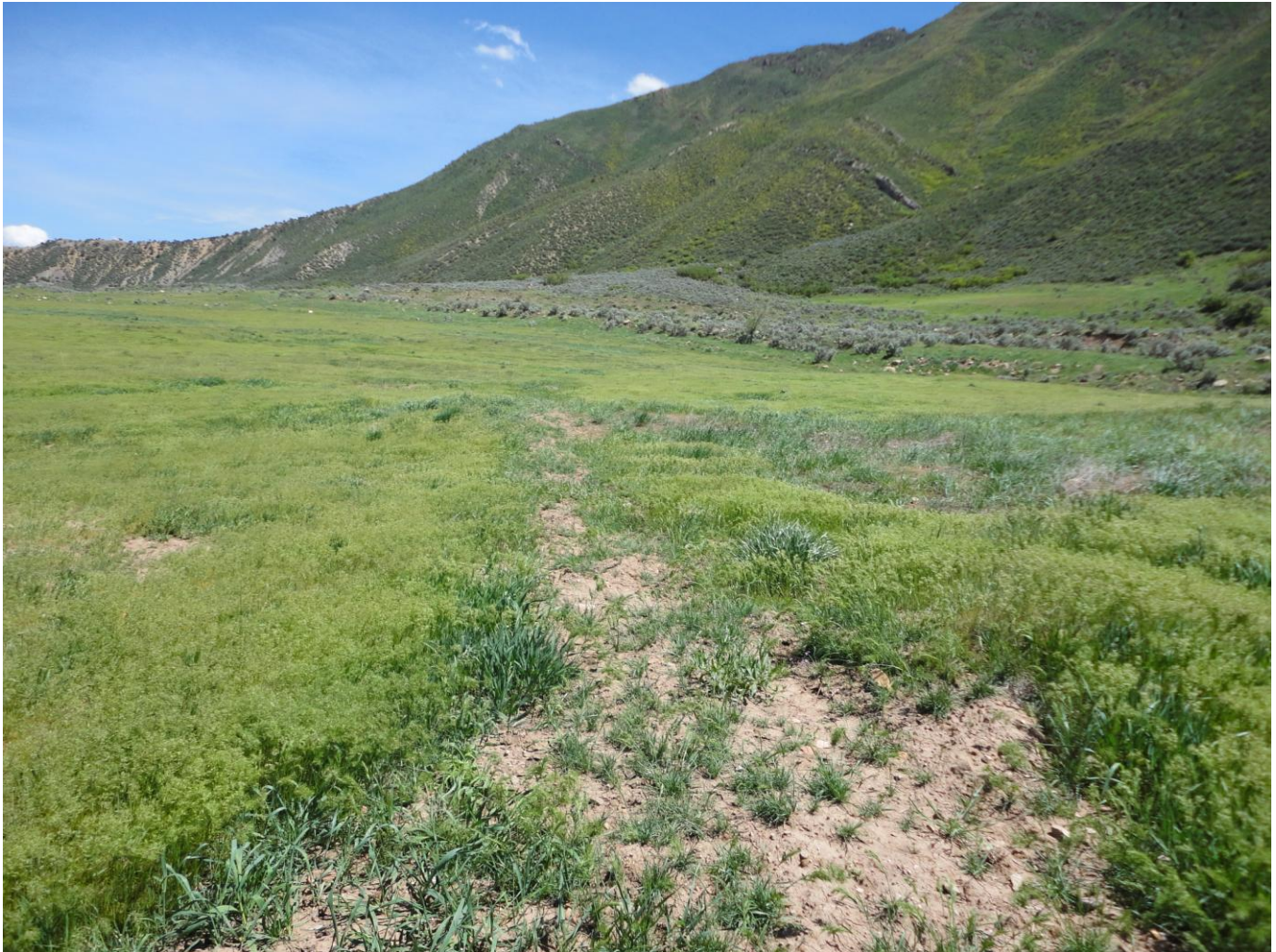
Reclaimed unapproved sediment ditch.

The reclaimed disturbance related to the unapproved sediment ditch has very successful vegetative growth.