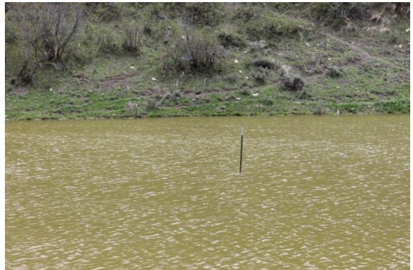
T-posts on south side