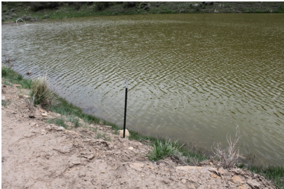
T-post on north side