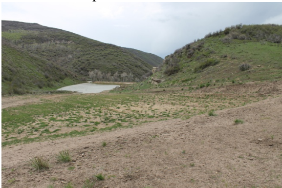
Disturbed area east of pond. Looking west

Number of Partial Inspection this Fiscal Year: 0