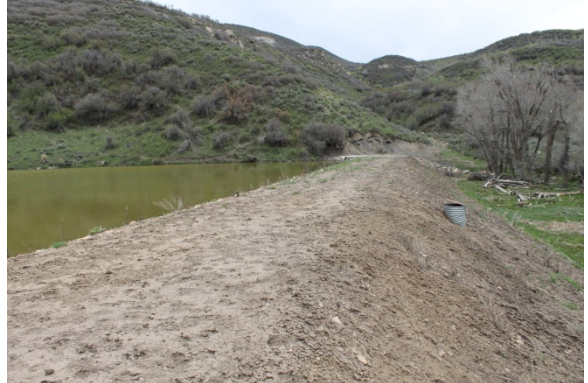
Dam embankment. Looking south