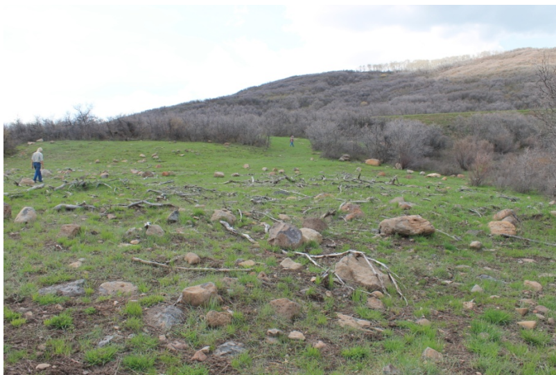
Reclaimed drill pad at site SS-3