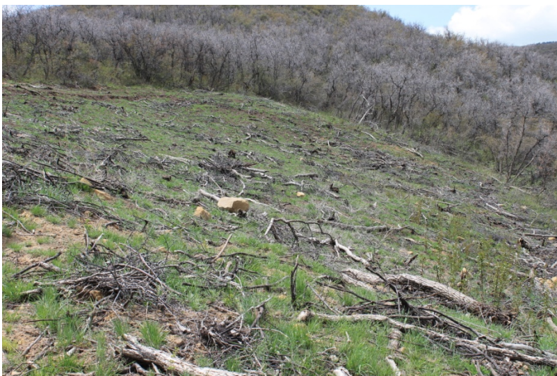
Reclaimed drill pad at site SS-9

Number of Partial Inspection this Fiscal Year: 0