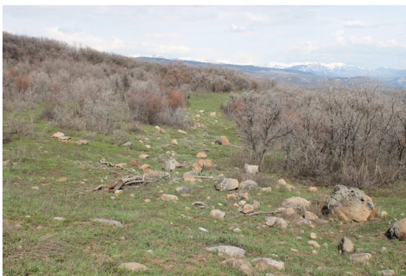
Reclaimed access road to site SS-4A and SS-4B

Number of Partial Inspection this Fiscal Year: 0