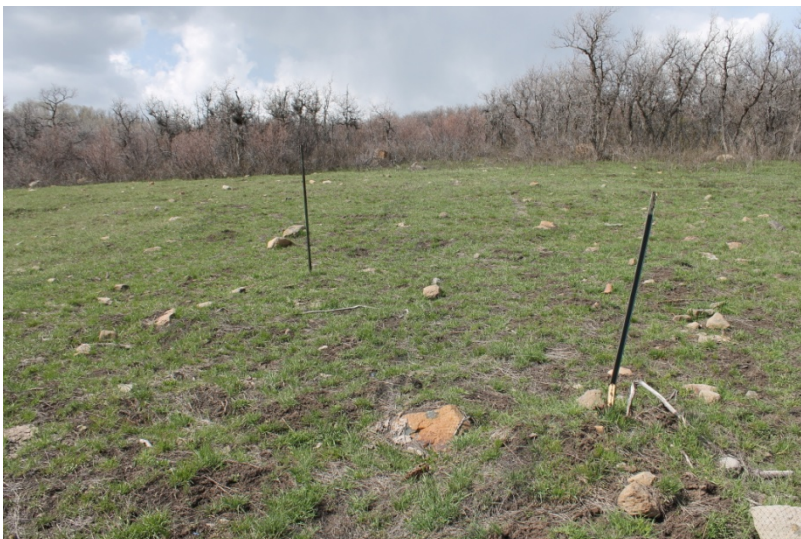
Borehole markers indicating SS-4A and SS-4B locations and reclaimed pad