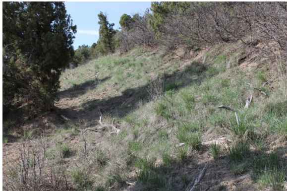
Segment of reclaimed access road to 8-2-9