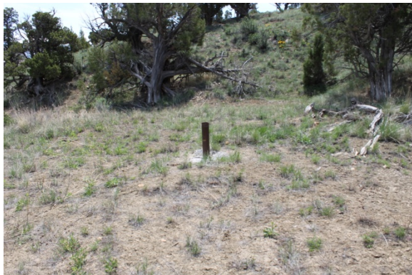
Monitoring well remains at site 8-3-10

Number of Partial Inspection this Fiscal Year: 0