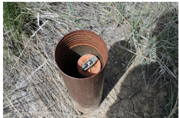
Monitoring well remains at site 8-2-8