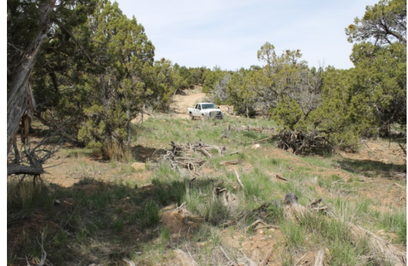
Segment of reclaimed access road to 8-2-7; Truck is on unreclaimed access road to 8-2-8