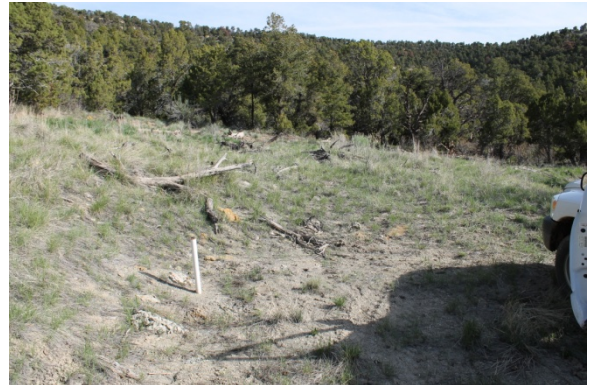
Monitoring well remains at site 7-34-7