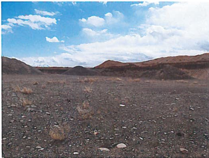
Figure 3: Facing southeast toward the highwall in the southeast part of the Phase 1 area.