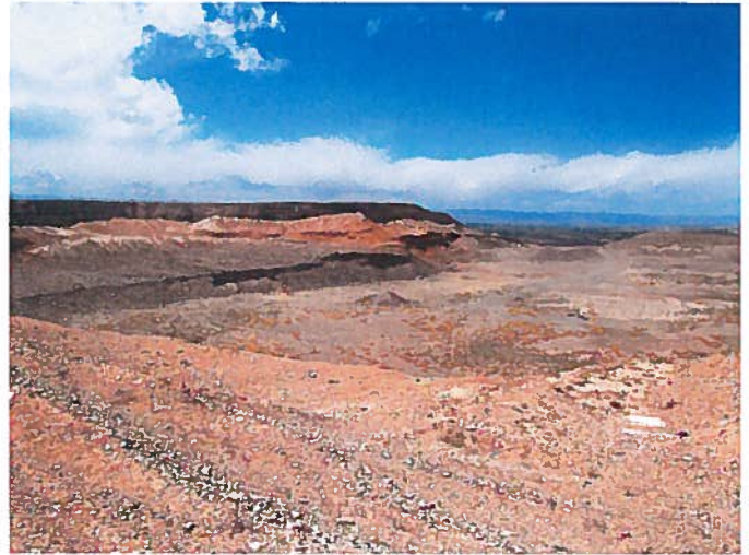
Figure 6: View from on top of the east highwall in the Phase 3 area, facing west.