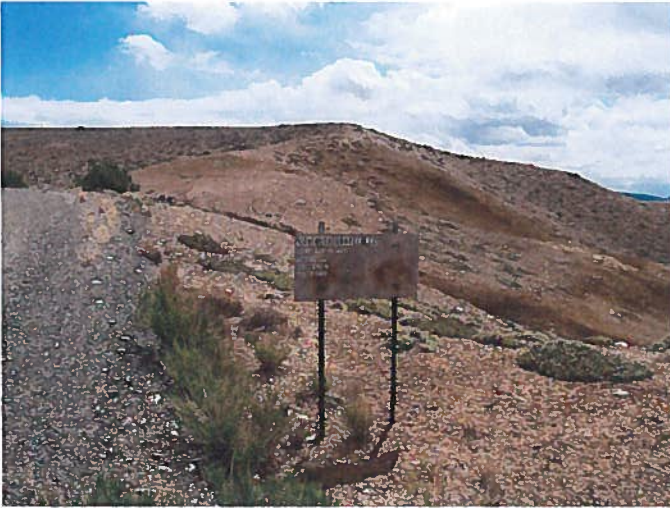
Figure 1: Mine identification sign located near the entrance to the site.