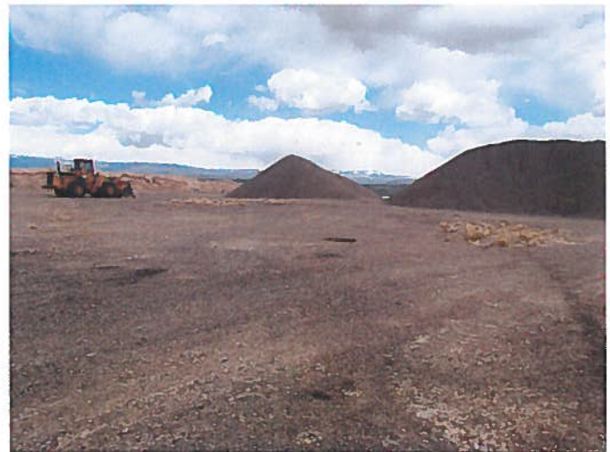
Figure 4: View of stockpiles located in the Phase 4 area.