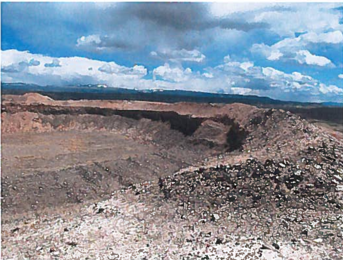
Figure 7: View from on top of the south highwall in the Phase 1 area, facing northeast.