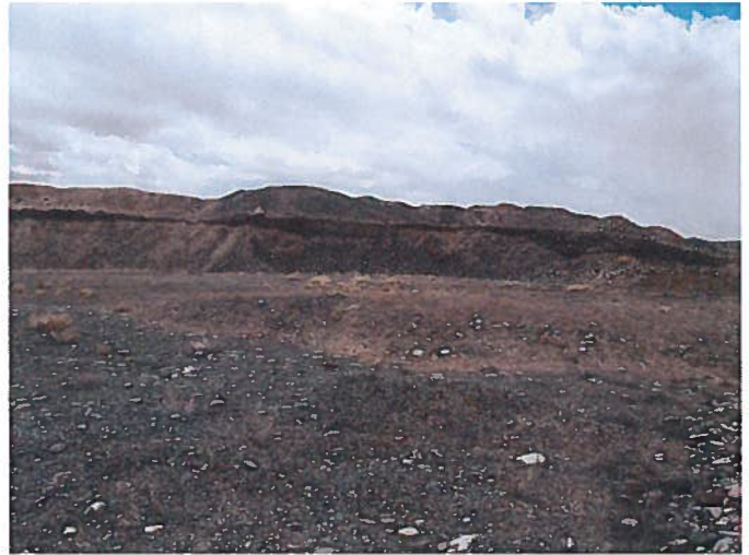
Figure 2: Facing south, toward the highwall located in the south side of the Phase 1 area, on the east side of the access road.