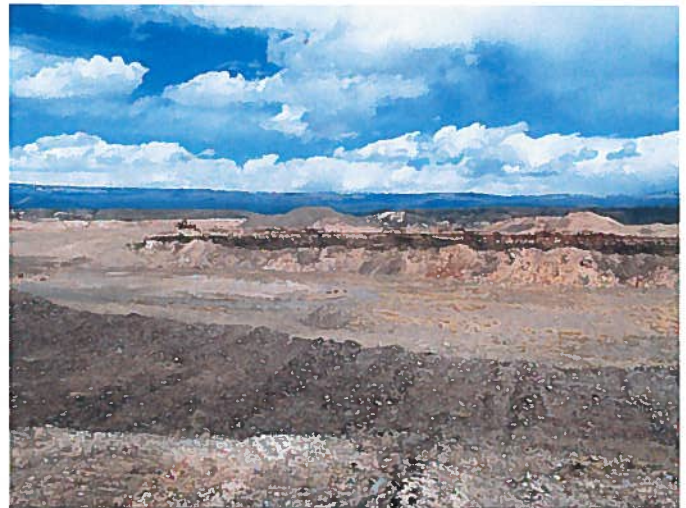
Figure 8: View from on top of the south highwall in the Phase 1 area, facing northeast.