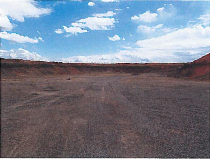
Figure 5: Facing east, toward the highwall located in the east side of the Phase 3 area.