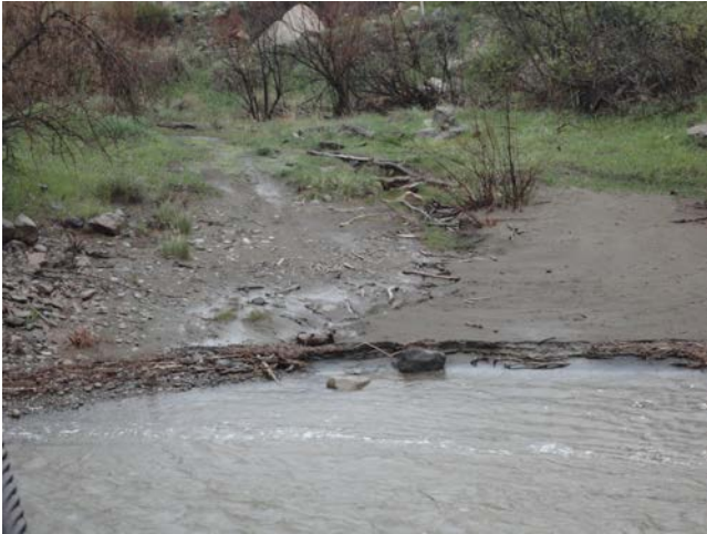
Seep flowing to North Fork of the Gunnison