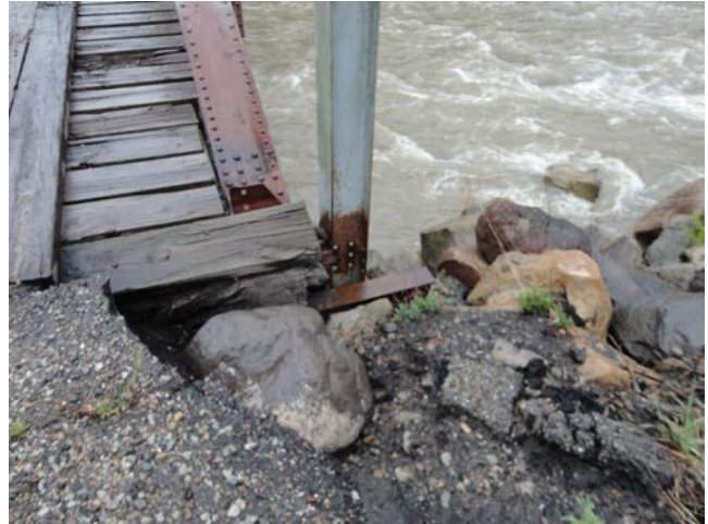
Northeast corner of bridge abutment