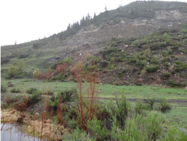
East end of reclamation