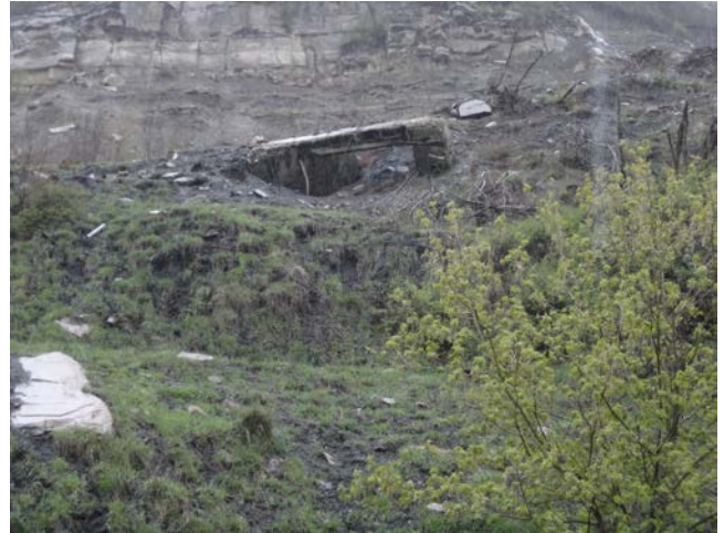
Edwards Portal slope

Number of Partial Inspection this Fiscal Year: 9