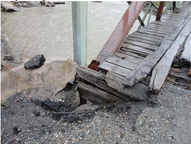
Southeast corner of bridge abutment