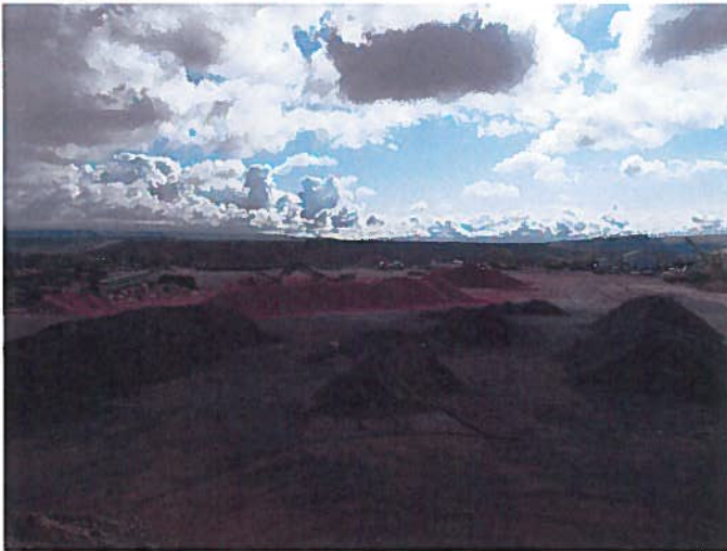
Figure 7: View from the top of the highwall, facing east.