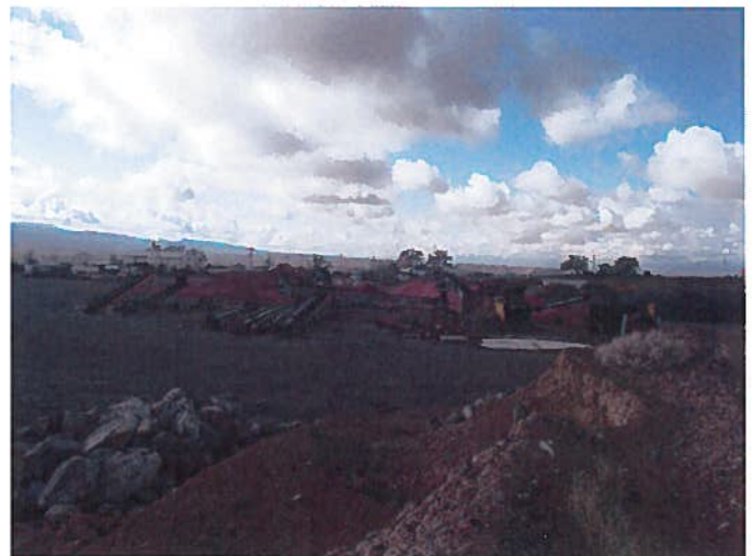
Figure 12: View facing south, from the north central part of the site.

Ed Benson Benson Brothers 21240 Austin Rd Austin, CO 81410