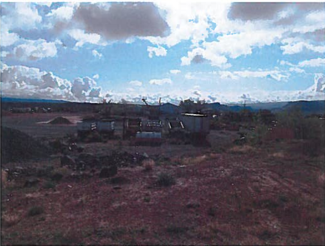
Figure 3: View facing east from the west central part of the site.