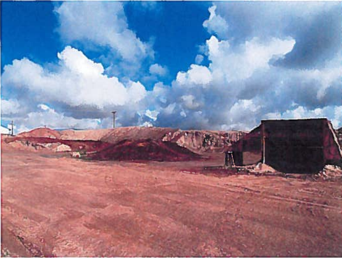
Figure 5: Mine area in the west part of the site.