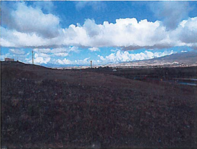
Figure 9: View of the north part of the site.