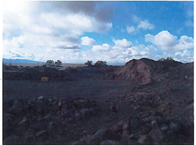
Figure 10: View facing south, from the north central part of the site.