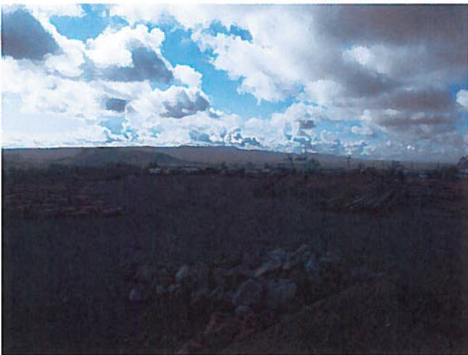
Figure 11: View facing south, from the north central part of the site.