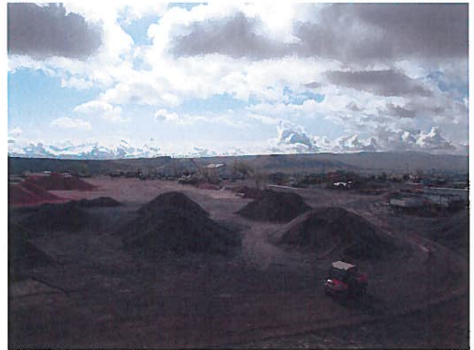
Figure 8: View from the top of the highwall, facing east.