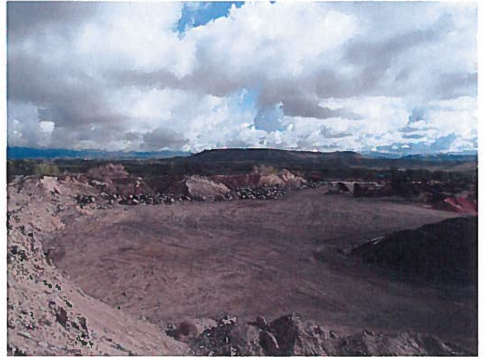
Figure 6: View towards the north part of the site.