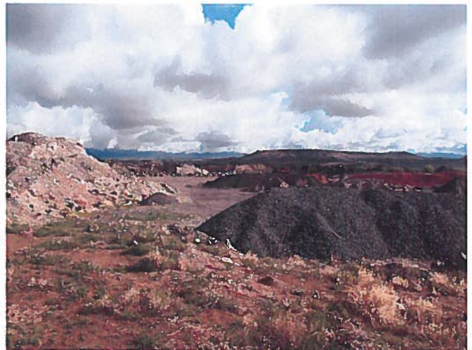
Figure 4: View facing north from the west central part of the site.