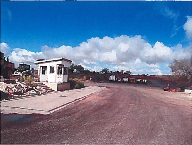
Figure 1: View facing west from the shop area.